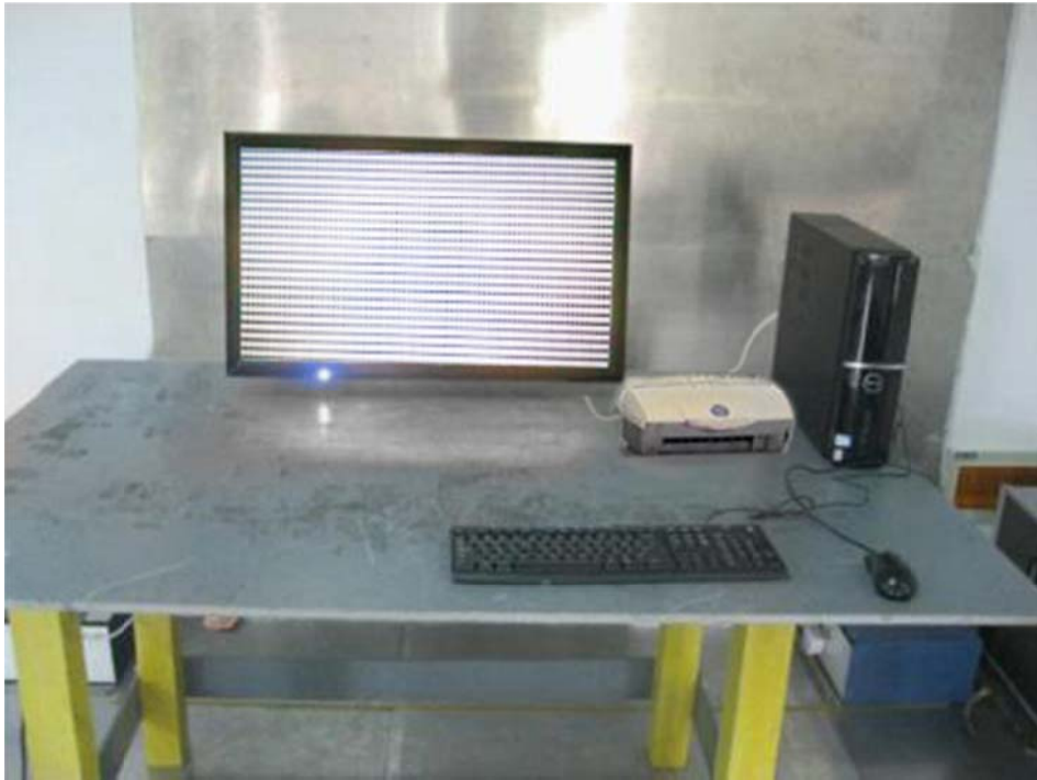
Radiated Emission (30MHz - 1GHz) – Front View