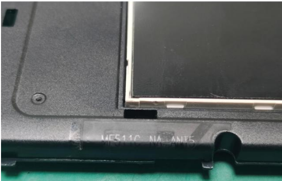
ANT5: no use.