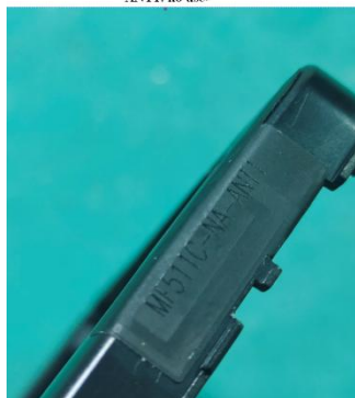
ANT1: no use.