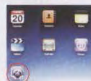
iPad [settings] icon

Step 3: Turn on and unlock iPad. Click on the iPad [settings] icon.