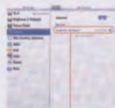
Keyboard connected successfully

Step 7: Wireless keyboard connected successfully. [power] indicator light will stay on until the keyboard is switched off.