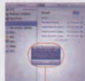
Enter password code using the wireless keyboard

Step 6: Enter the password code as displayed on screen.