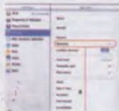
Click to turn on Bluetooth setting

Step 4: On the settings menu, select item [General] to access [Bluetooth] settings. Click on [Bluetooth] to turn on the connection. iPad will automatically search for a Bluetooth-enabled device.