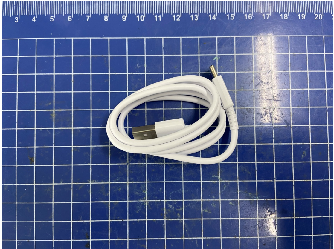
GH39-01999A RFTECH Co., Ltd.