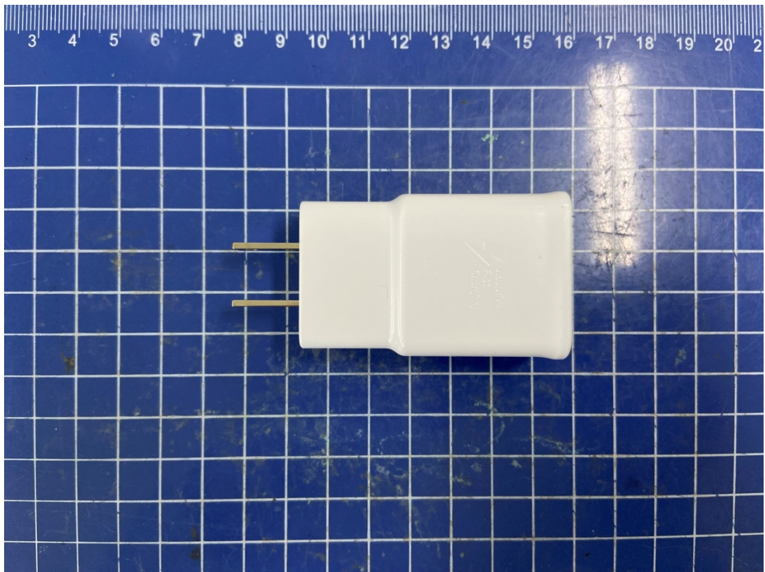
EP-TA200 RFTECH Co., Ltd. Pic2