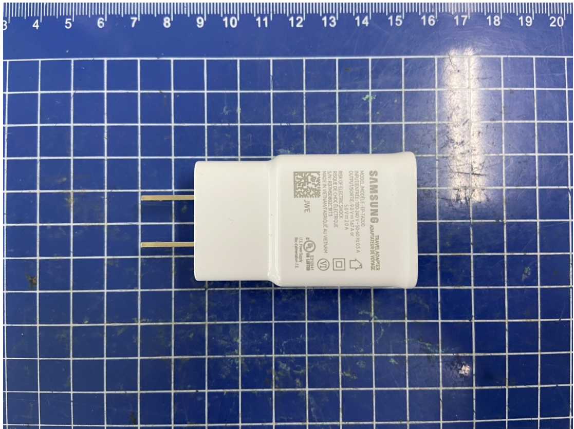
EP-TA200 RFTECH Co., Ltd. pic1