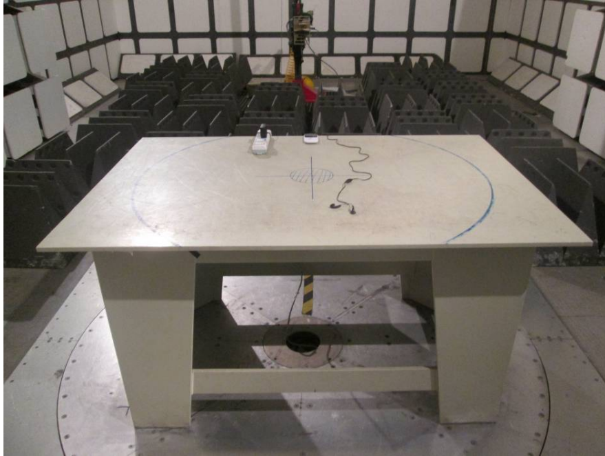
Radiated Emissions – Rear View (1-25 GHz)