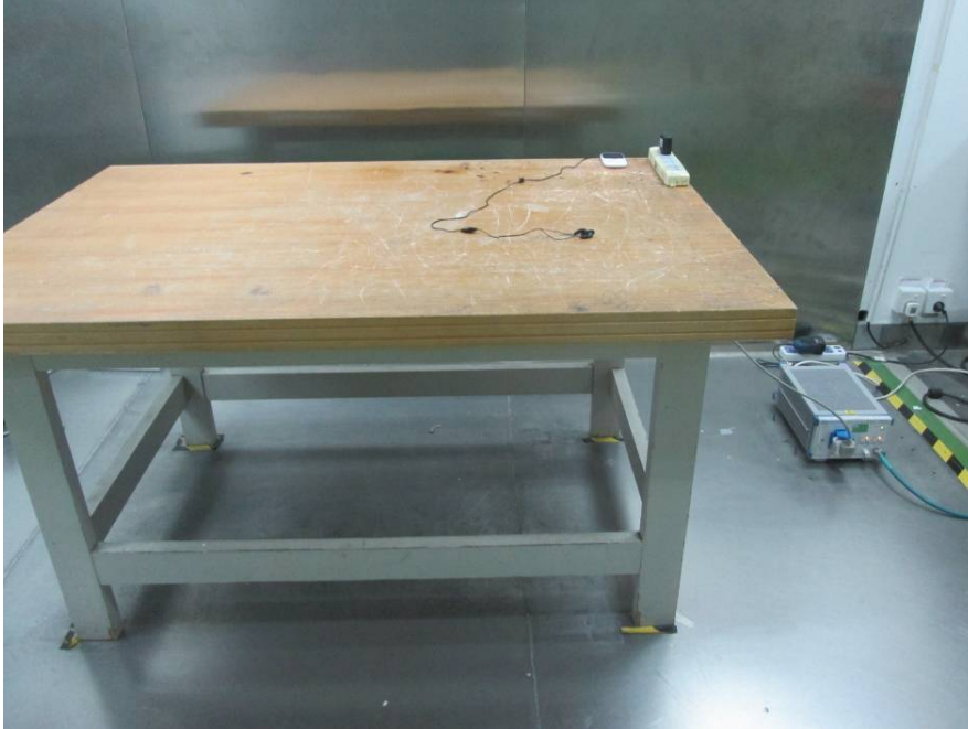
Conducted Emissions - Side View