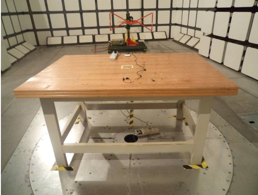
Radiated Emissions – Rear View (30-1000 MHz)