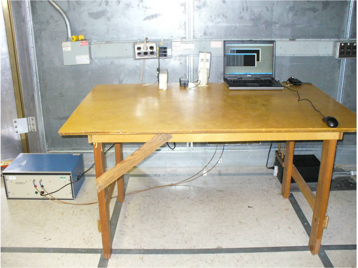
Figure 5: Power Line Conducted Measurements (Front View)