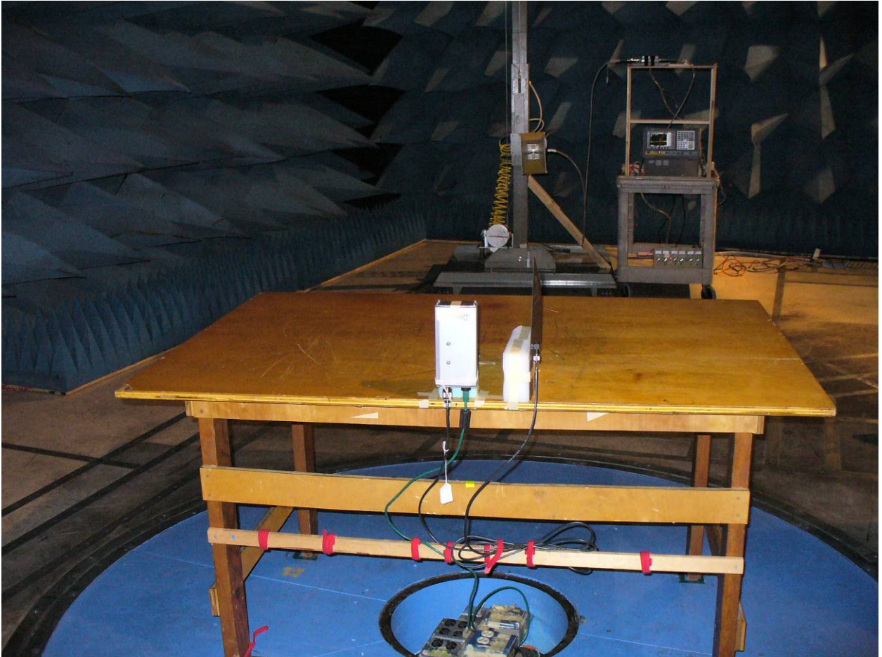
Figure 3: Radiated Emissions (Back View)