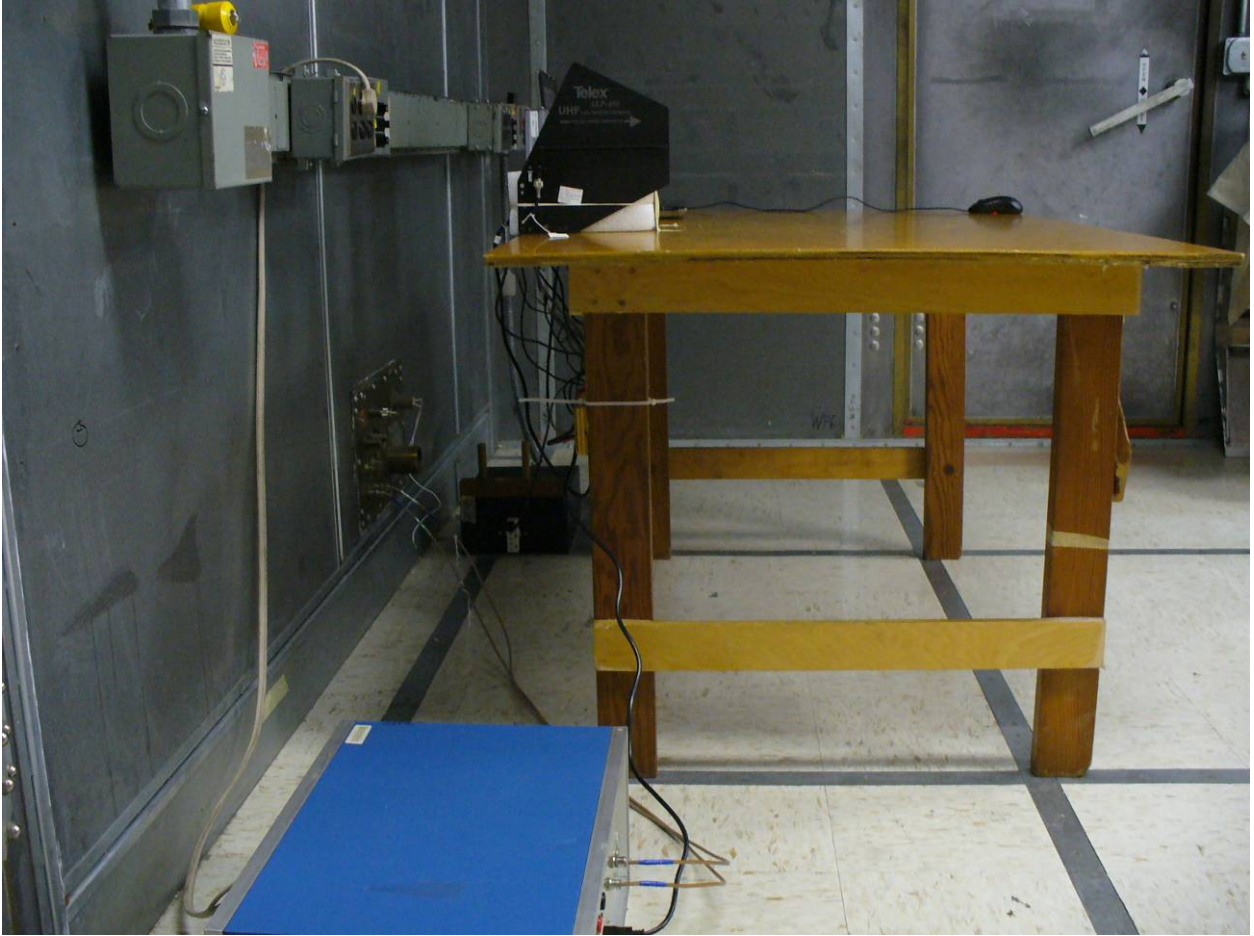
Figure 6: Power Line Conducted Measurements (Side View)