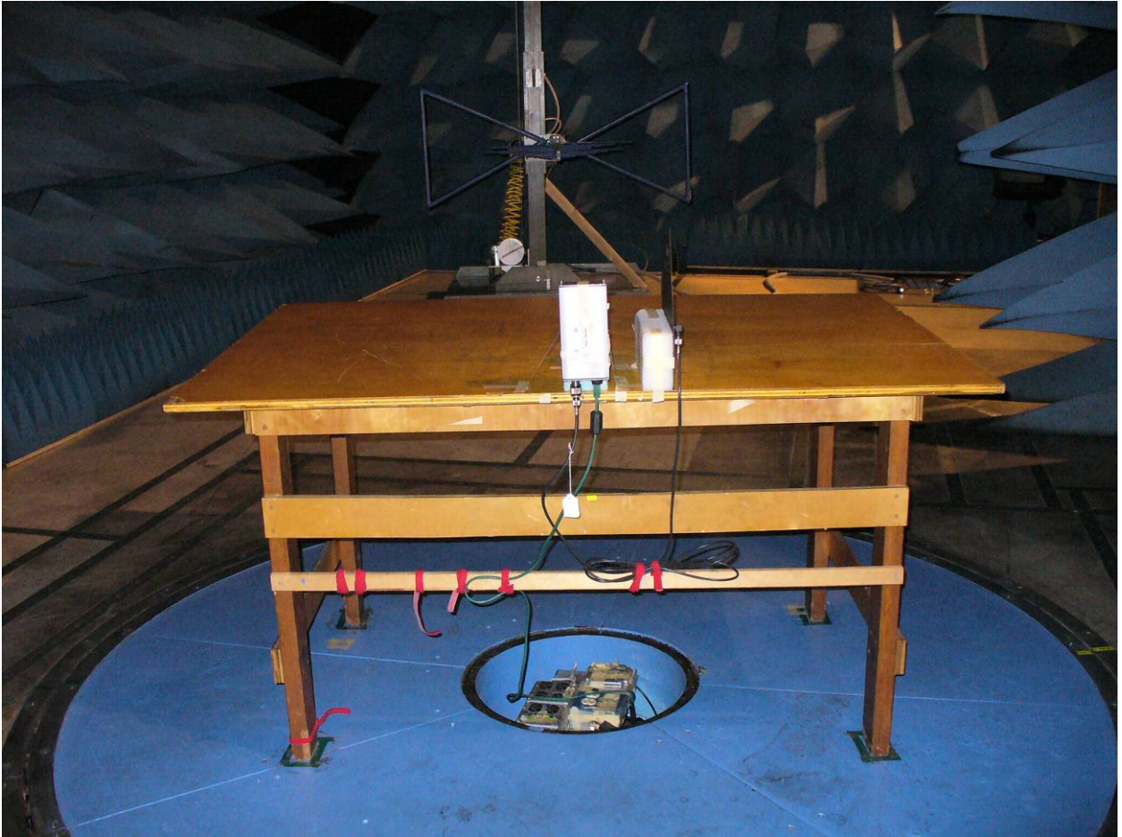
Figure 1: Radiated Emissions (Back View)