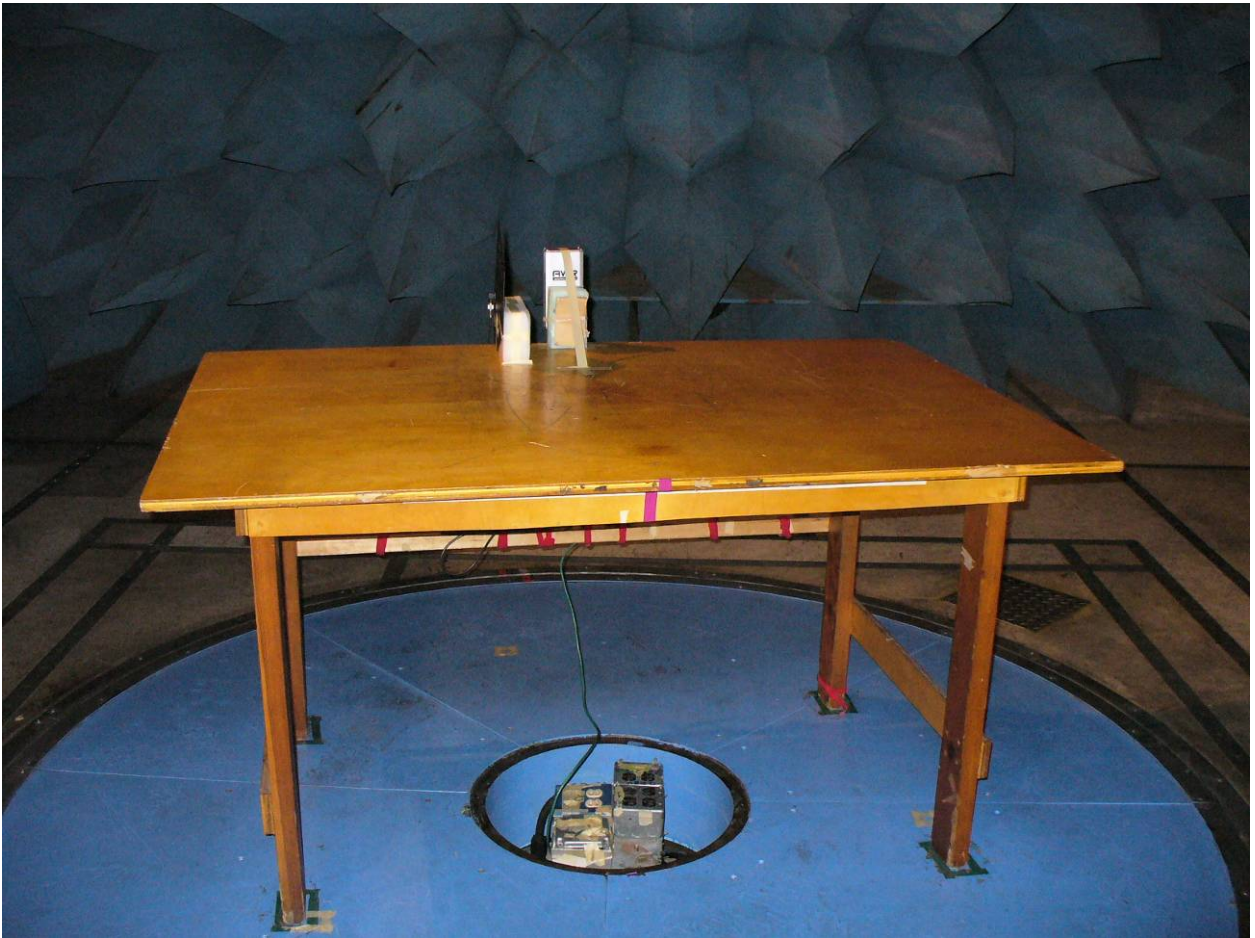
Figure 1: Radiated Emissions (Front View)