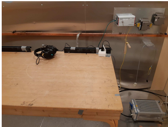
Power-Line Conducted Emissions