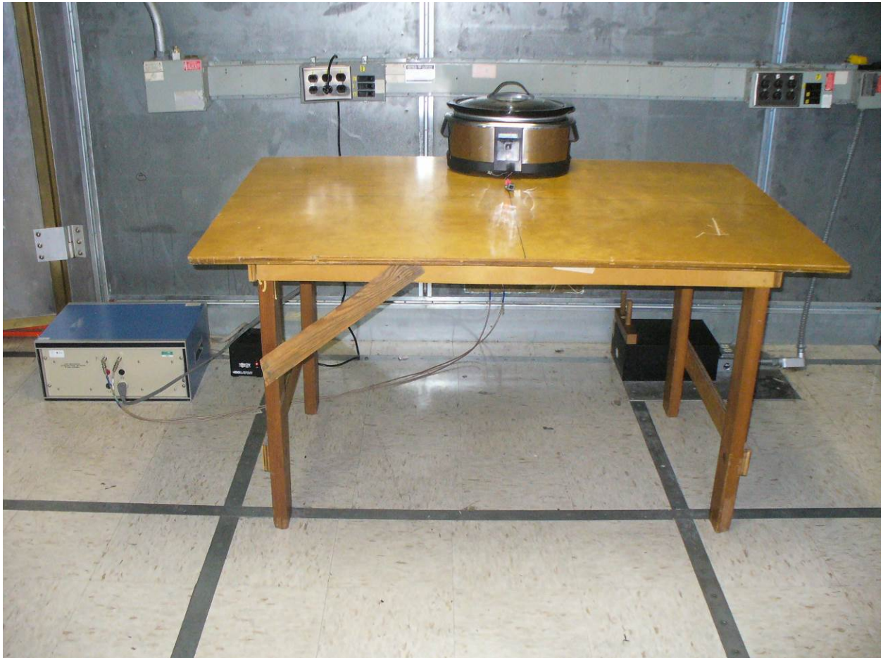
Figure 4: Power Line Conducted Emissions – Front View