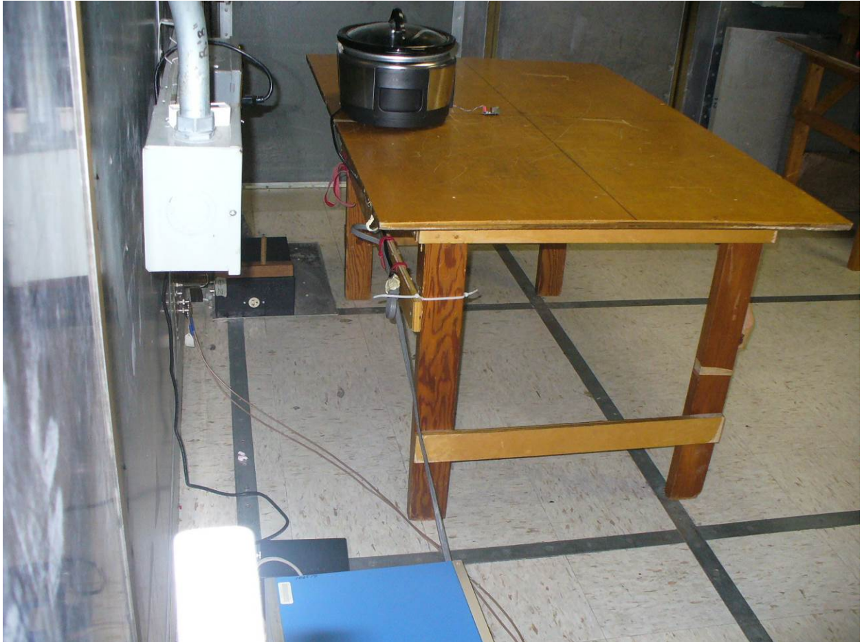
Figure 5: Power Line Conducted Emissions – Side View