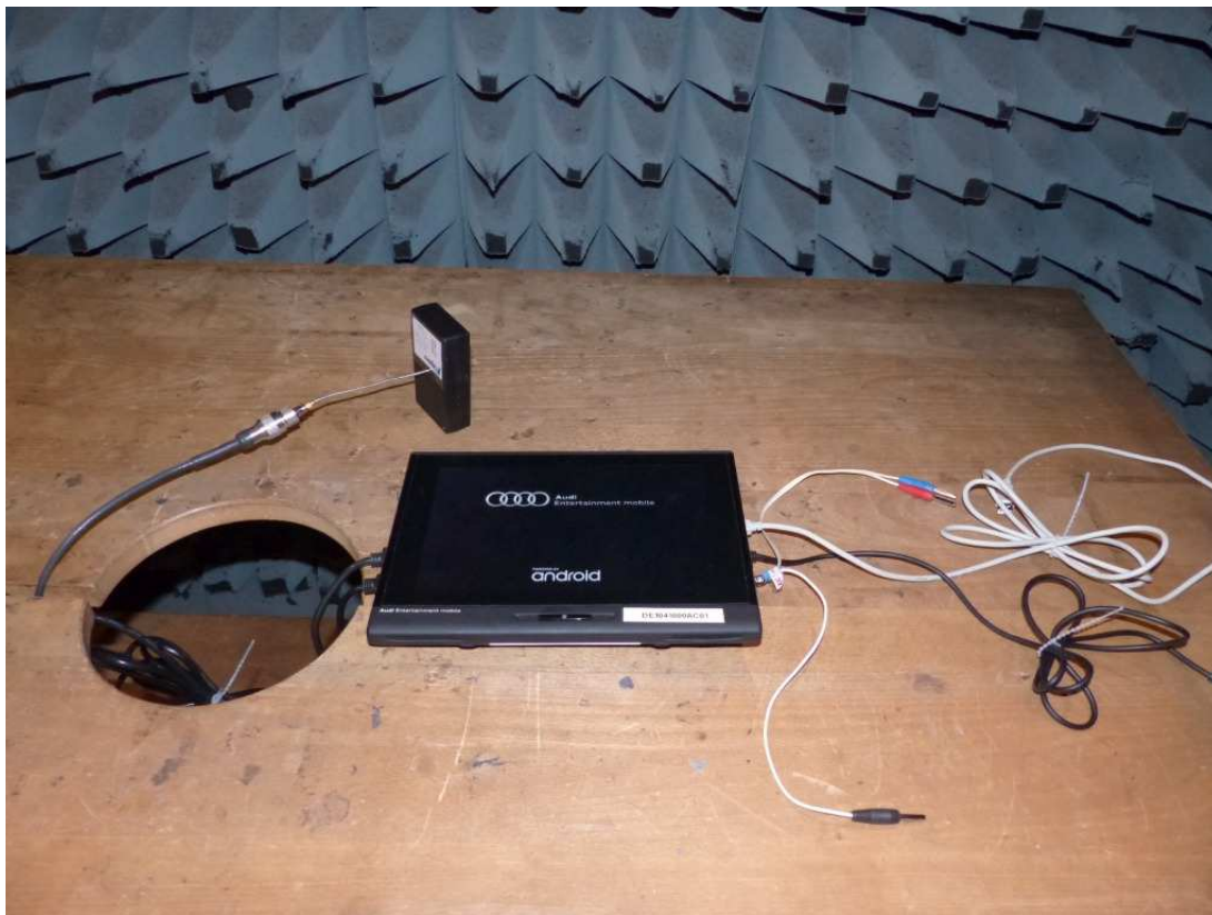
Photo 1: Test setup for radiated measurements (Enclosure, below 30 MHz, intentional radiator §15)