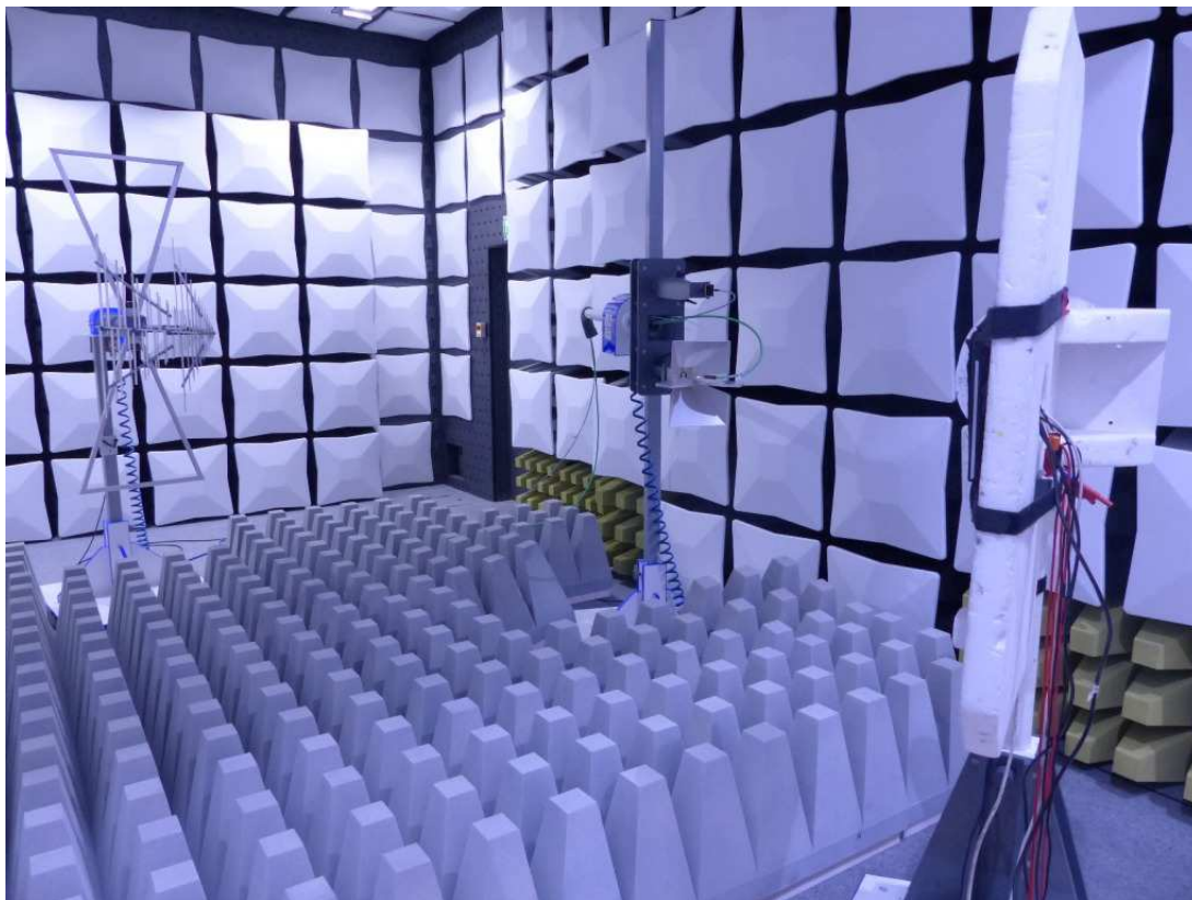
Photo 3: Test setup for radiated measurements (Enclosure, fully-anechoic chamber, 1-25 GHz intentional radiator §15)