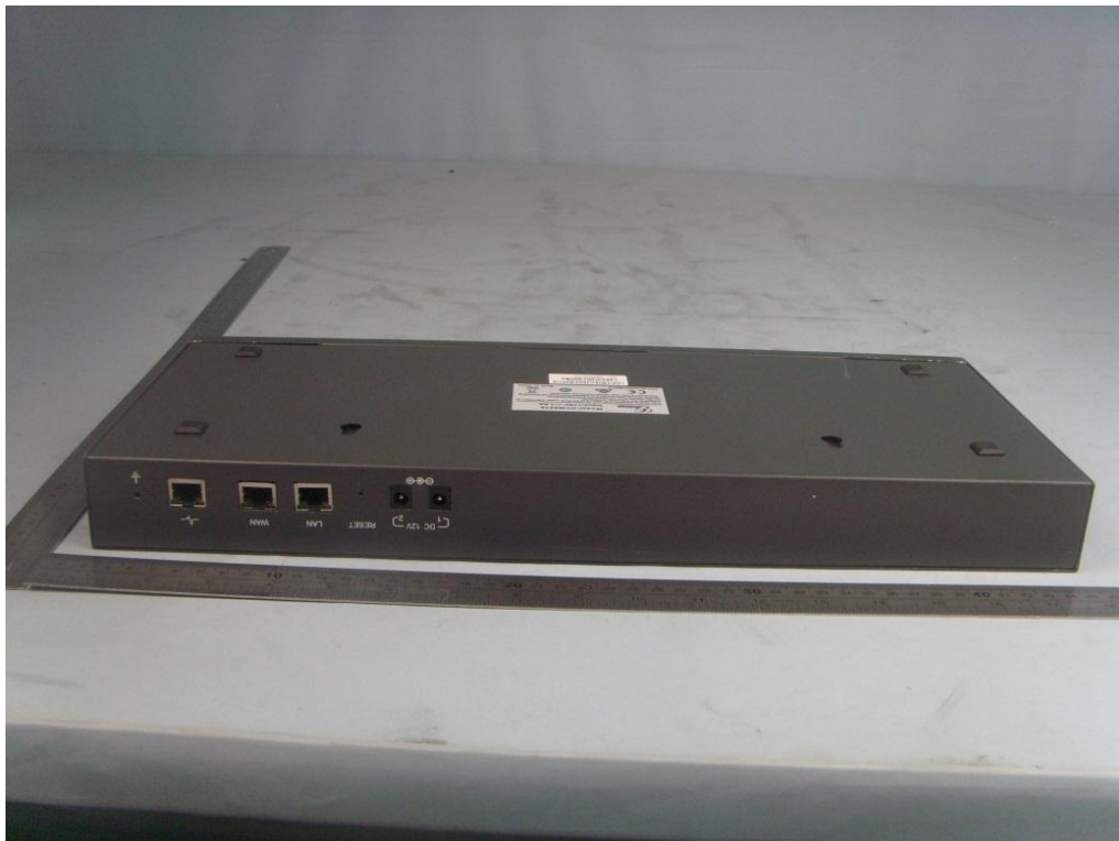
EUT- Rear&Bottom View