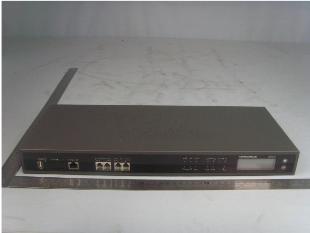
EUT- Front&Top View