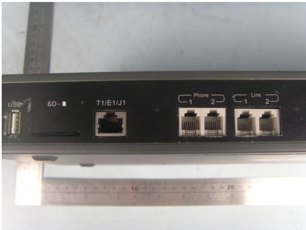
EUT - I/O Ports View #1