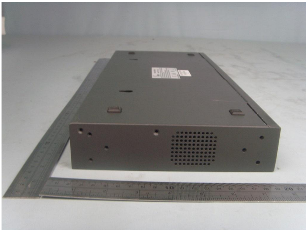
EUT -Left Side View