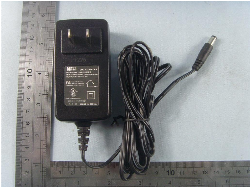
Power Adaptor View (Manufacturer: Mass Power)