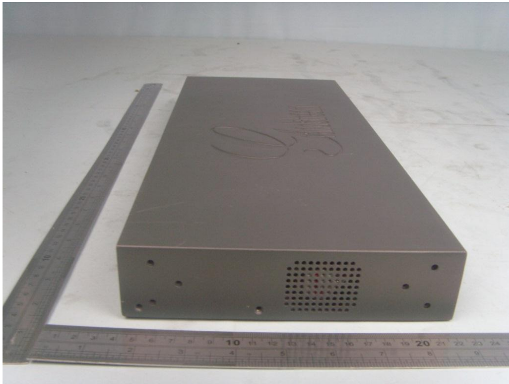
EUT -Right Side View