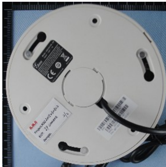
EUT Bottom View/Proposed FCC Mark Location