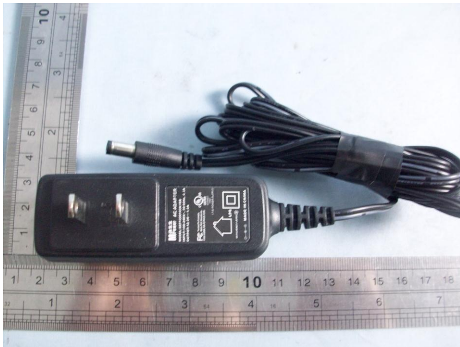
Adaptor View #1 (Manufacturer: Mass Power)