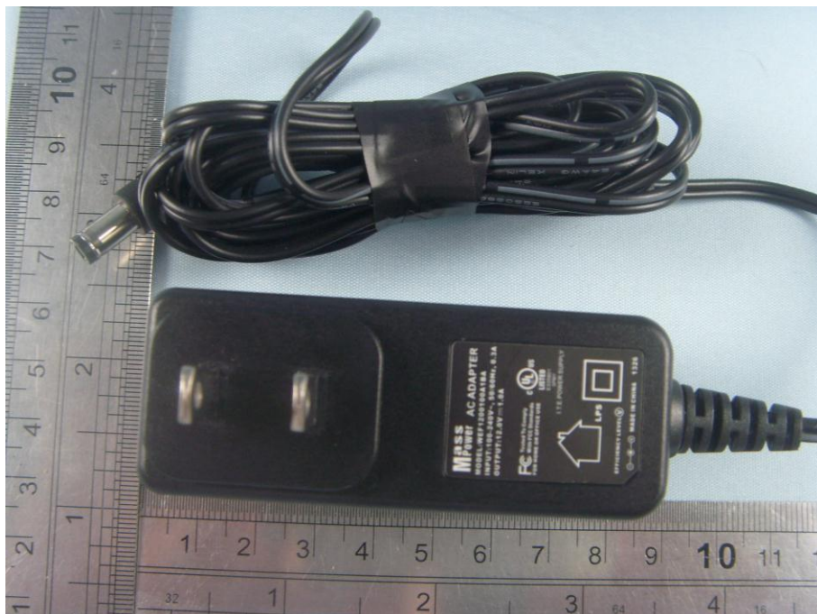
Adaptor View #2 (Manufacturer: Mass Power)