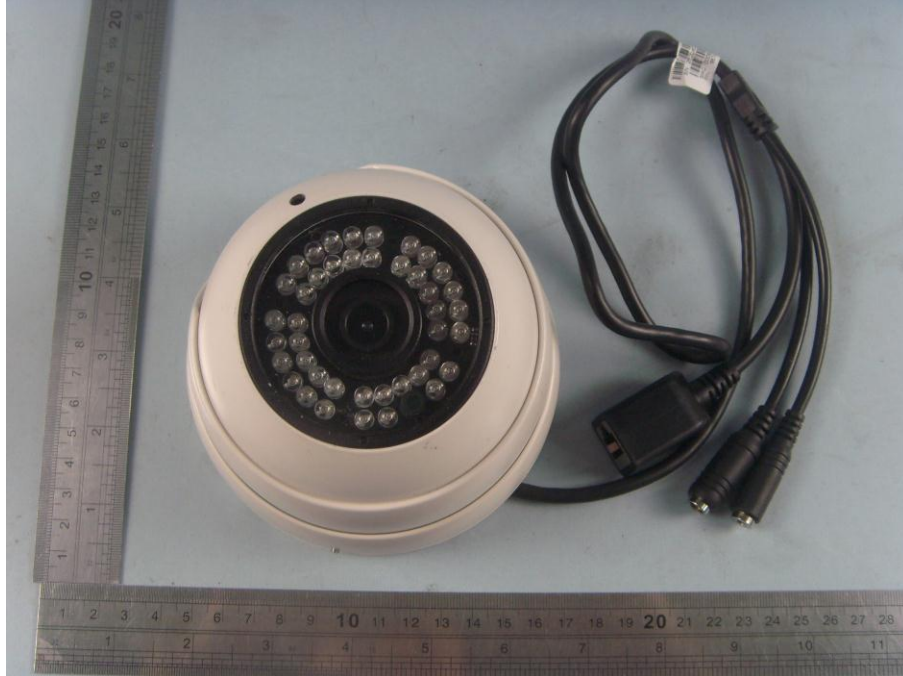
EUT- Front View