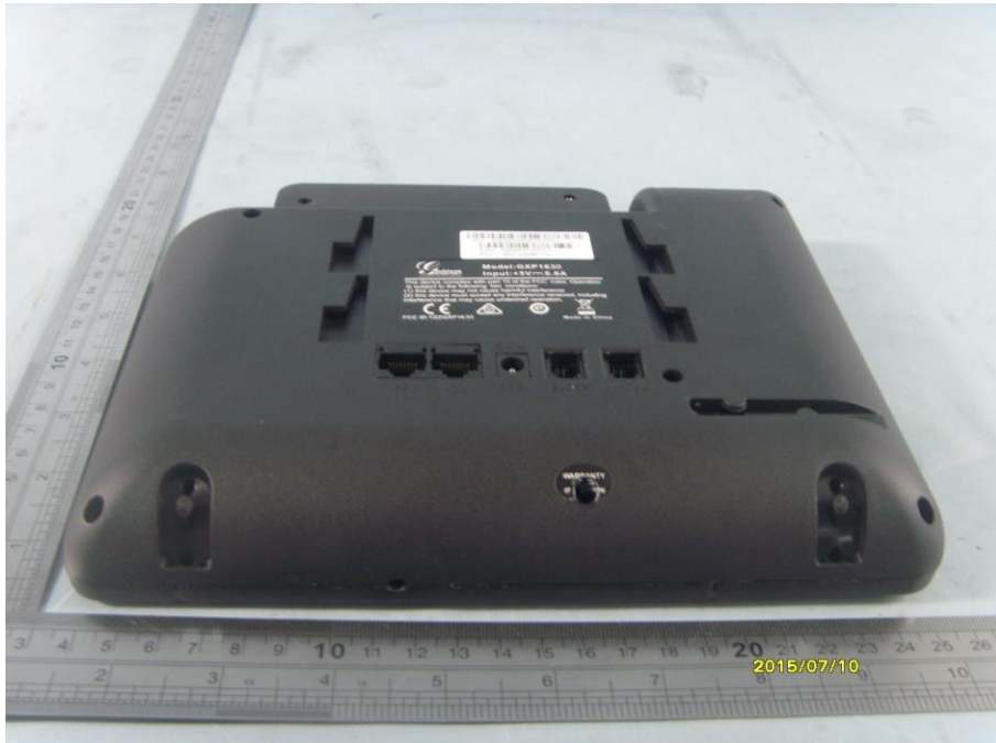
EUT- Bottom View