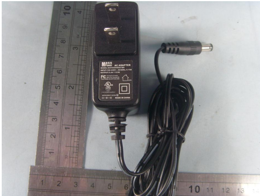
Power Adapter #1 View(Manufacturer: Mass power)