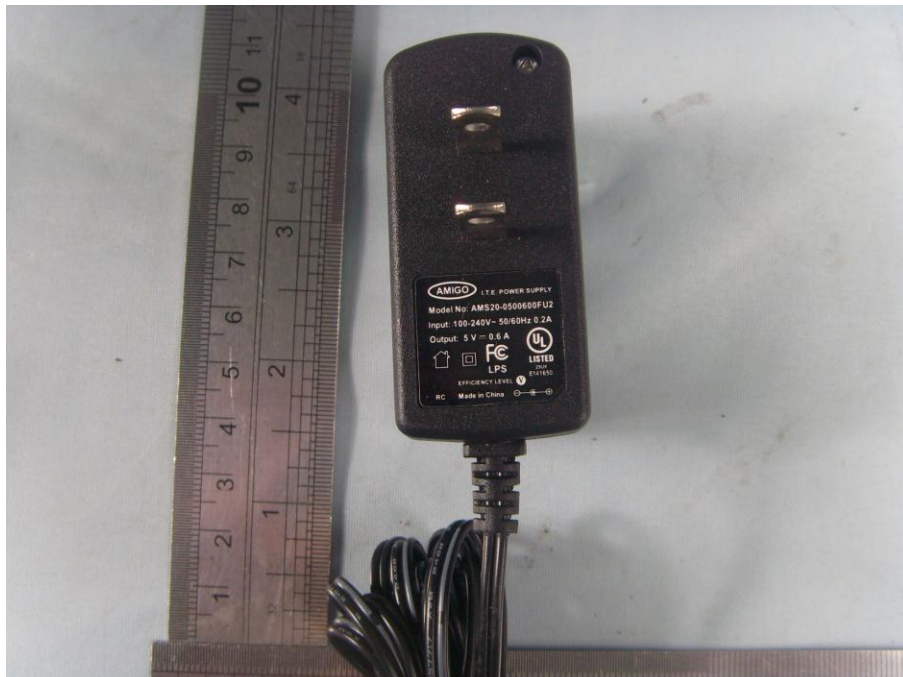
Power Adapter #2 View(Manufacturer: AMIGO)