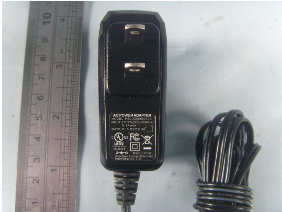
Power Adapter #3 View(Manufacturer: Sunlight)