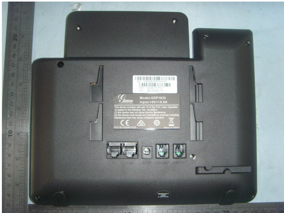
EUT- Rear View