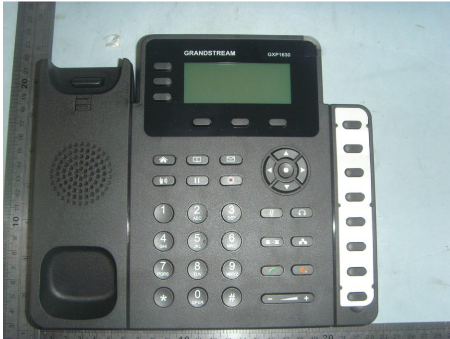
EUT- Front View