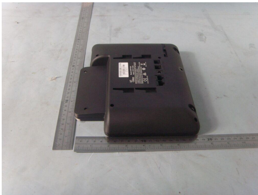
EUT- Right Side View