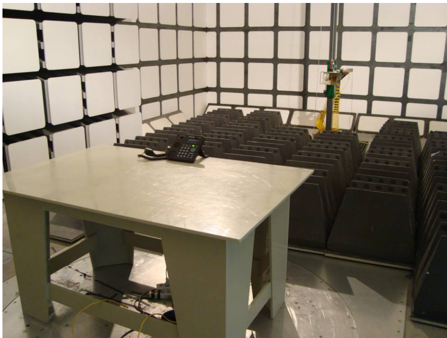
Radiated Emissions - Rear View (Above 1 GHz, Powered by POE)