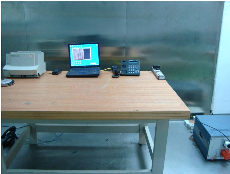
Conduction Emissions - Side View (Powered by AC/DC adapter)