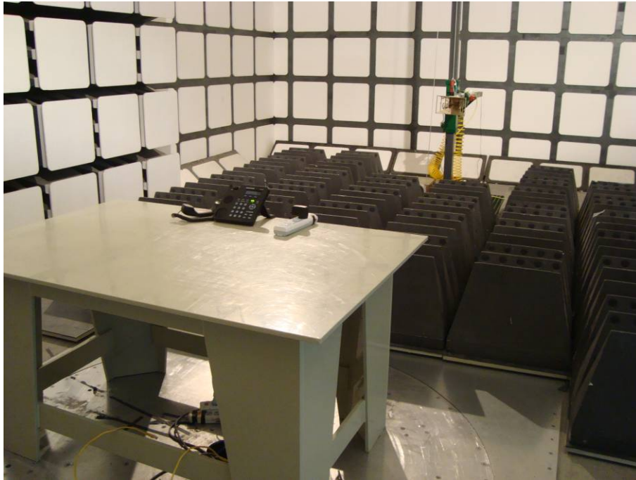
Radiated Emissions - Rear View (Above 1 GHz, Powered by AC/DC adapter)