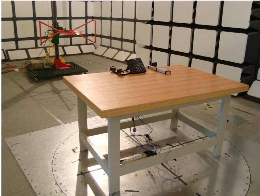
Radiated Emissions - Rear View (30-1000 MHz, Powered by AC/DC adapter)