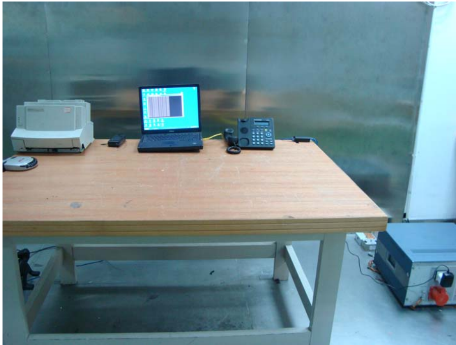
Conduction Emissions - Side View (Powered by POE)