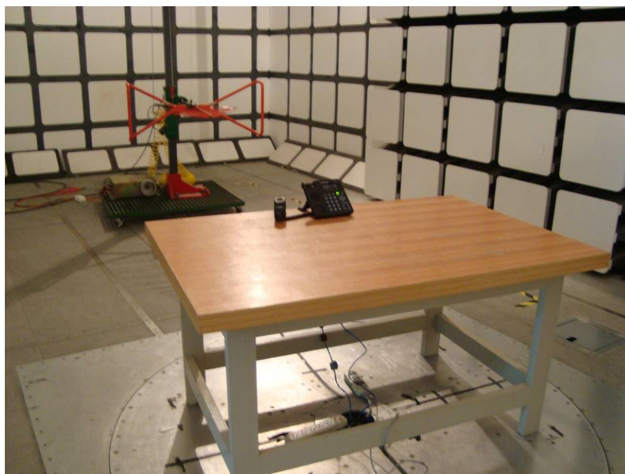
Radiated Emissions - Rear View (30-1000 MHz, Powered by POE)