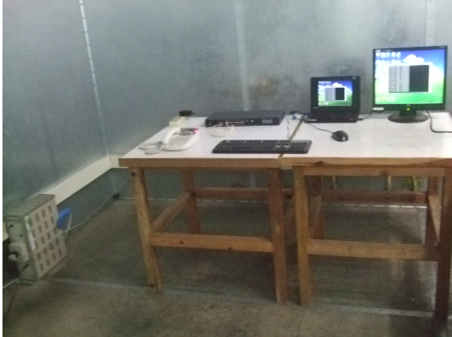
Conducted Emission Test Set-up -front view