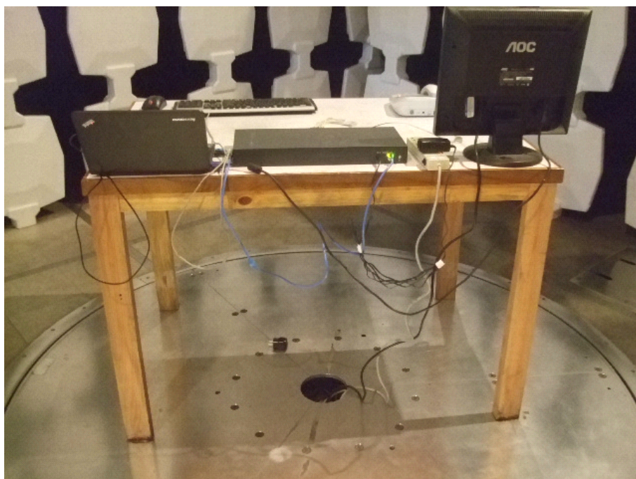
Radiated Emission Test Set-up (rear view)