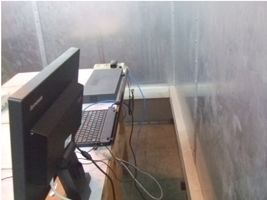
Conducted Emission Test Set-up -rear view