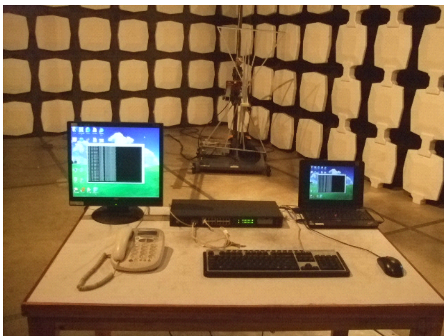
Radiated Emission Test Set-up (Below 1GHz)