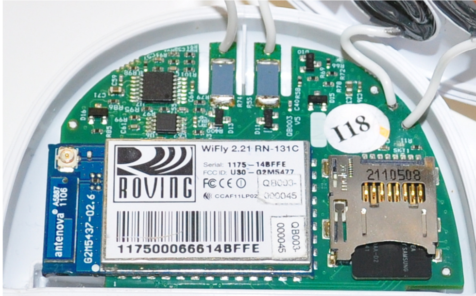
Aingeal Device View of PCB showing Wi-Fi module and SD card