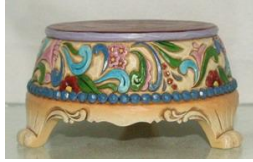
4020794 Princess Sonata Musical Base (Require AA size battery x 3. Battery not included.)

This Musical Base is designed to be used with one of the following figurines at one time. (Figurines are sold separately)