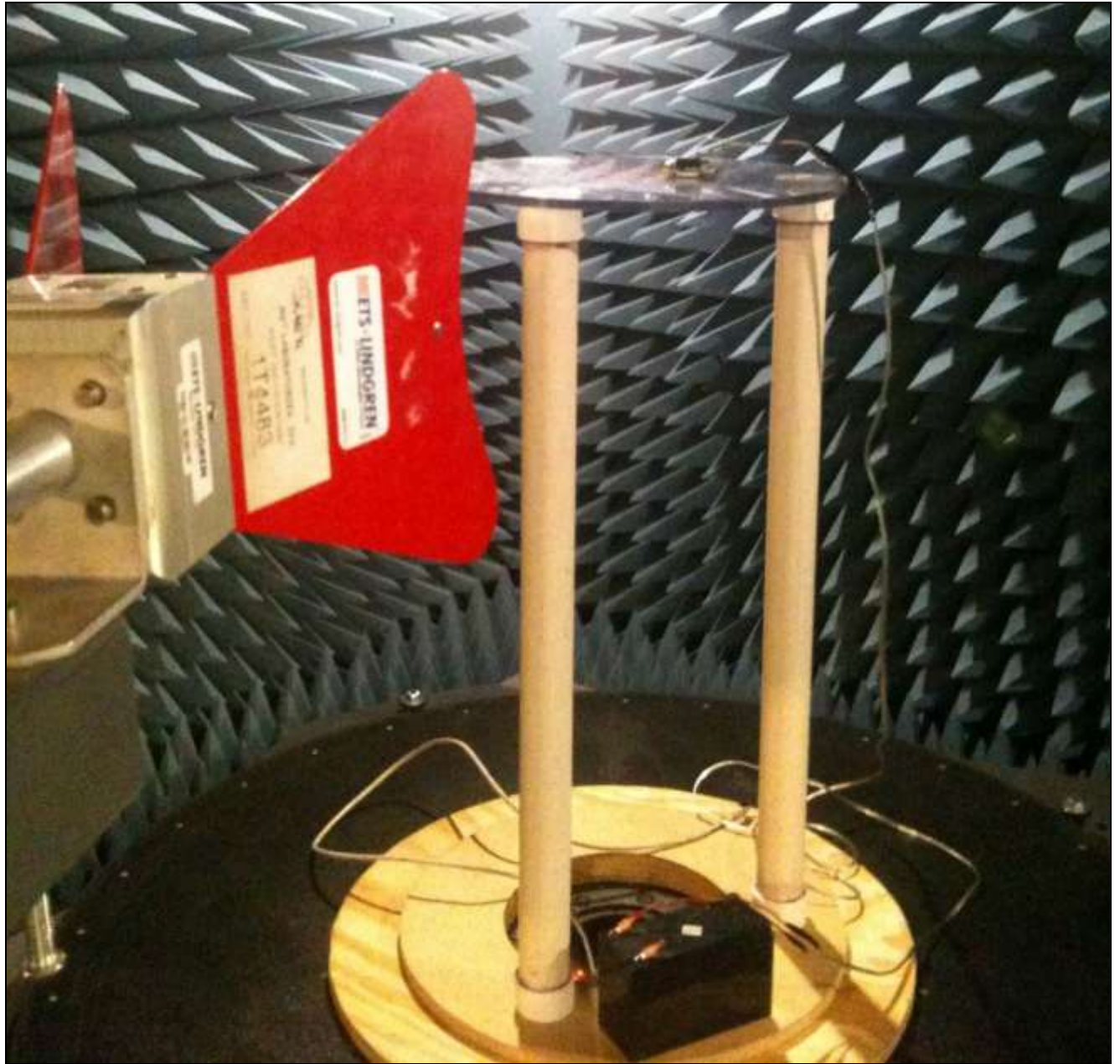
Photograph 3. Radiated Spurious, Test Setup