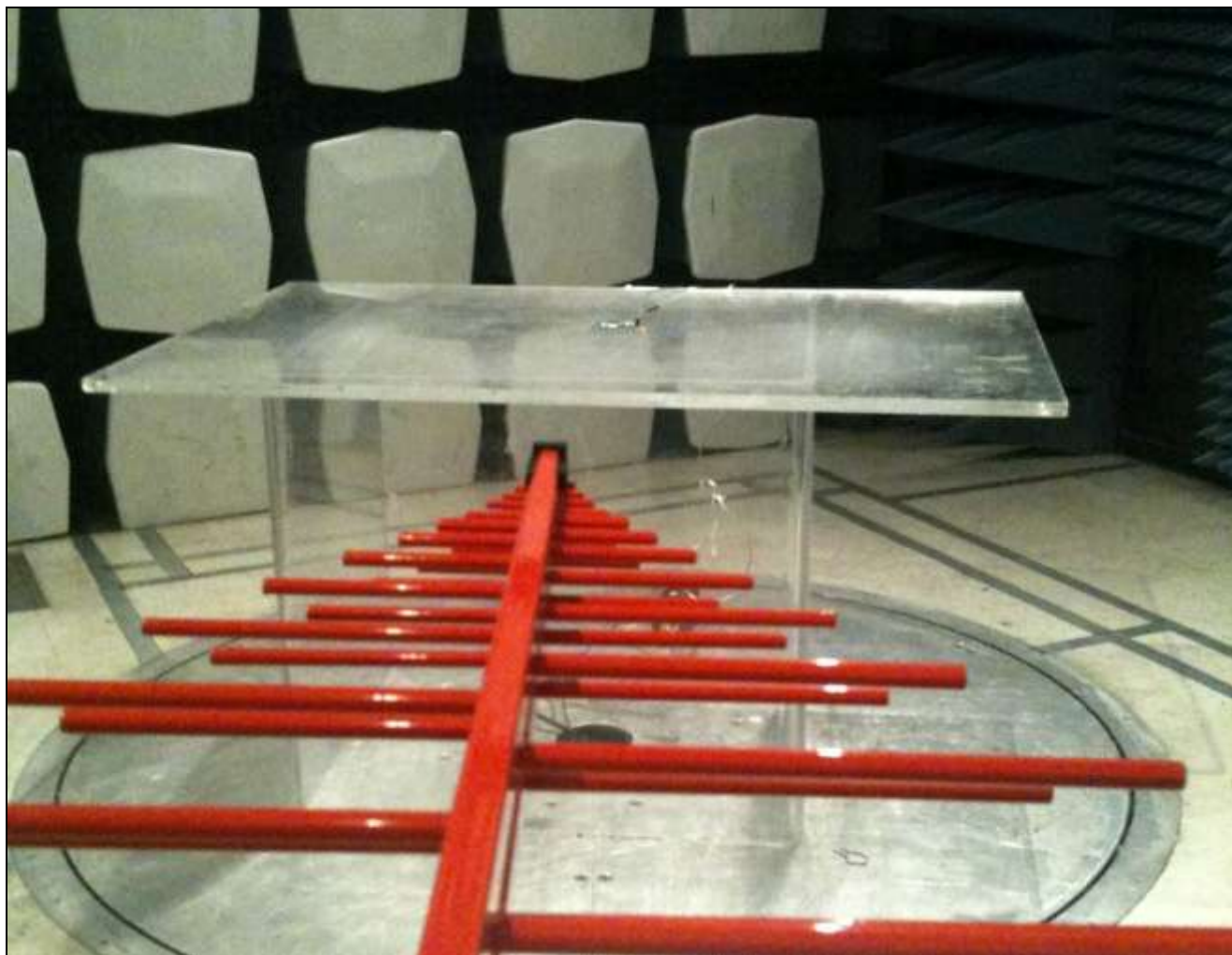
Photograph 1. Radiated Emissions, Test Setup