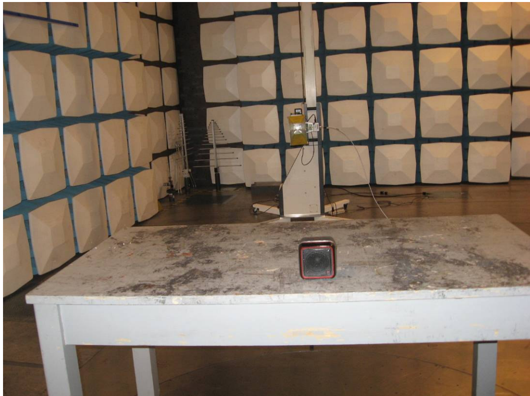
Set-up for Radiation Emission (Transceiver)