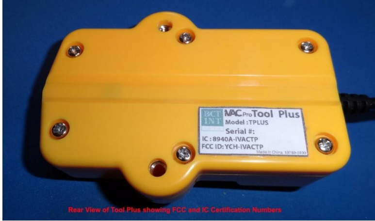
Rear View of Tool Plus showing FCC and IC Certification Numbers