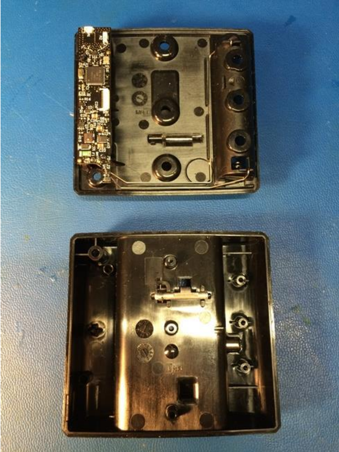
Fig. 1: TTV2-Belt internals and top of PCBA