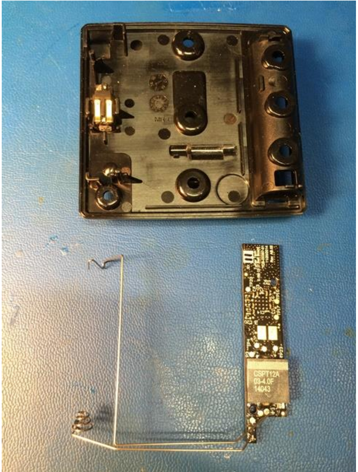
Fig. 2: TTv2-Belt Belt bottom of PCBA with PCBA removed