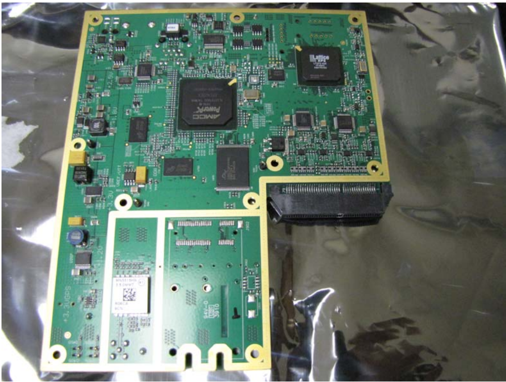
Main Board backside.