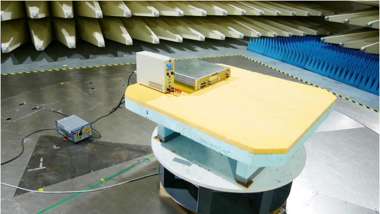
Test setup for AC powerline conducted emissions