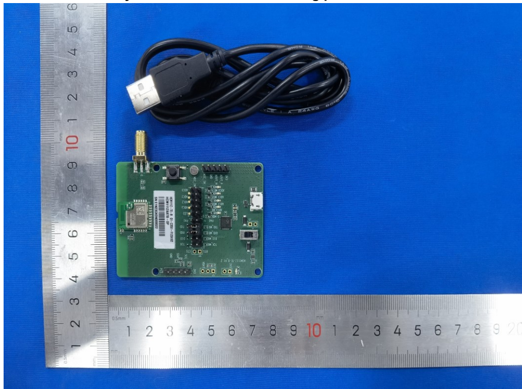
Test auxiliary PCB board and surrounding photos