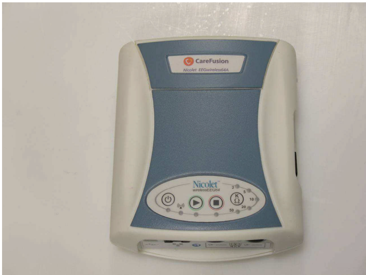
Figure 2: Front of Test Sample

Photographs of the test sample and its accessories are shown in Figure 2 through Figure 5.