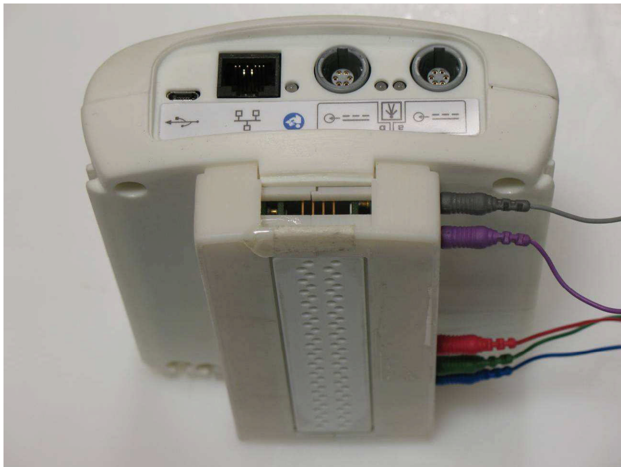
Figure 3: Back Side of Test Sample with Amp Installed

Model Number: 32 Channel Wireless EEGXGU-515-015X00