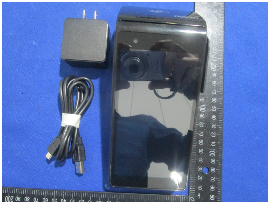
EXHIBIT B – EUT EXTERNAL PHOTOGRAPHS