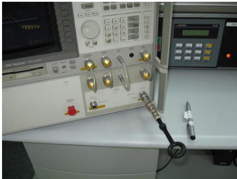
Photograph No.1 Occupied bandwidth measurement setup