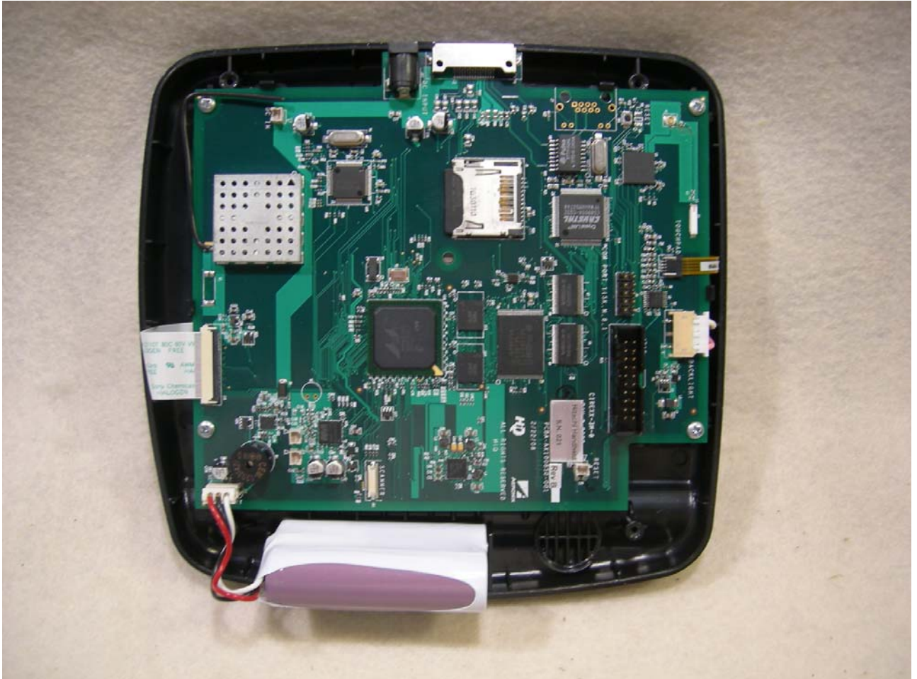
Figure 1: PCB with Shields - Front