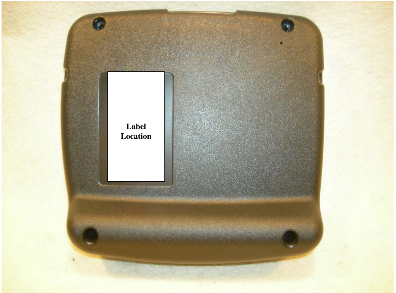
Figure 2: Label Location