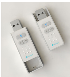
Bluetooth adapter (optional) which could connect solar speaker by USB