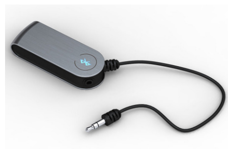
It could connect solar speaker by 3,5mm audio device interface.