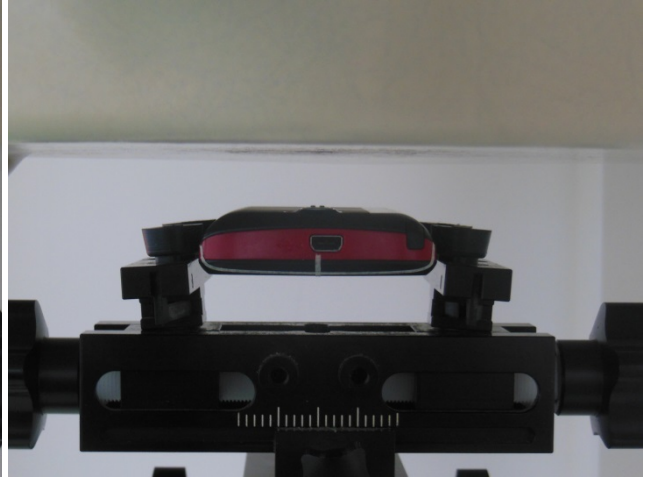
Back of the DUT with Phantom 1.5 cm Gap