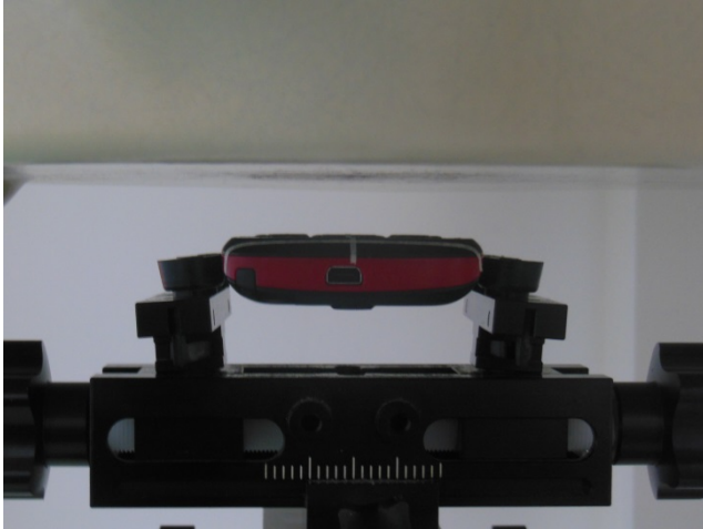
Front of the DUT with Phantom 1.5 cm Gap