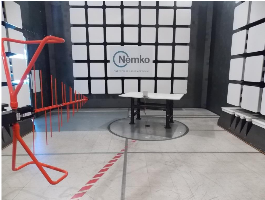
Figure 1-1: Radiated emissions setup photo – 30 to 1000 MHz