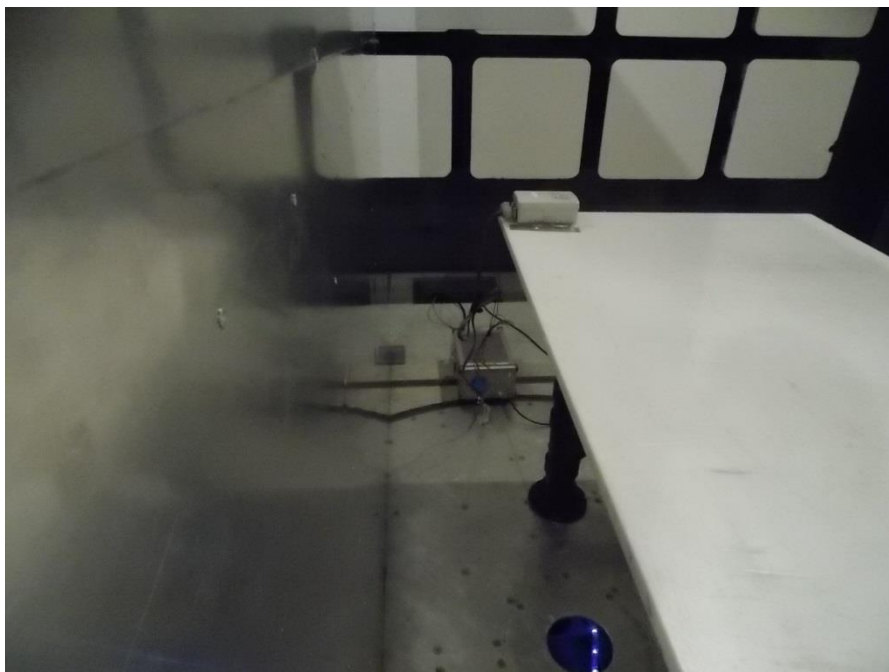
Figure 1-6: Conducted emissions setup photo