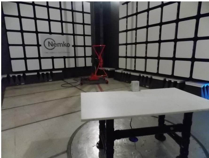
Figure 1-2: Radiated emissions setup photo – 30 to 1000 MHz