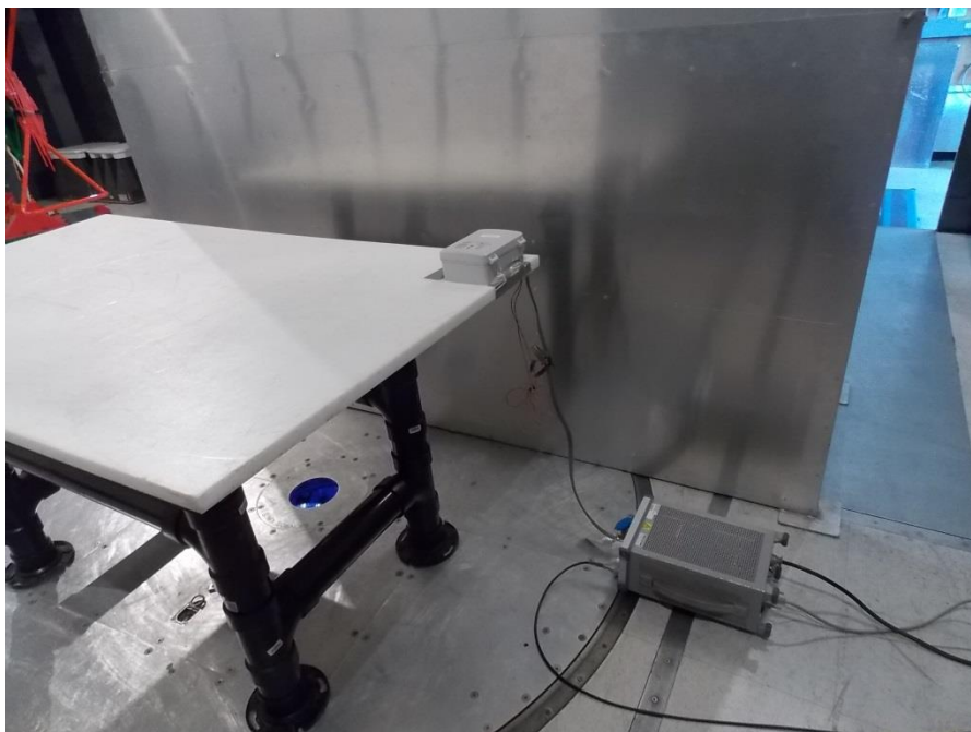
Figure 1-5: Conducted emissions setup photo