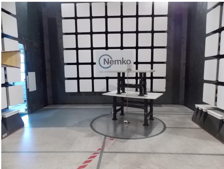
Figure 1-3: Radiated emissions setup photo – above 1 GHz