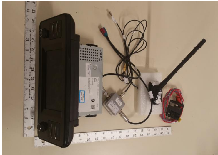
Figure B4: DUT Samples