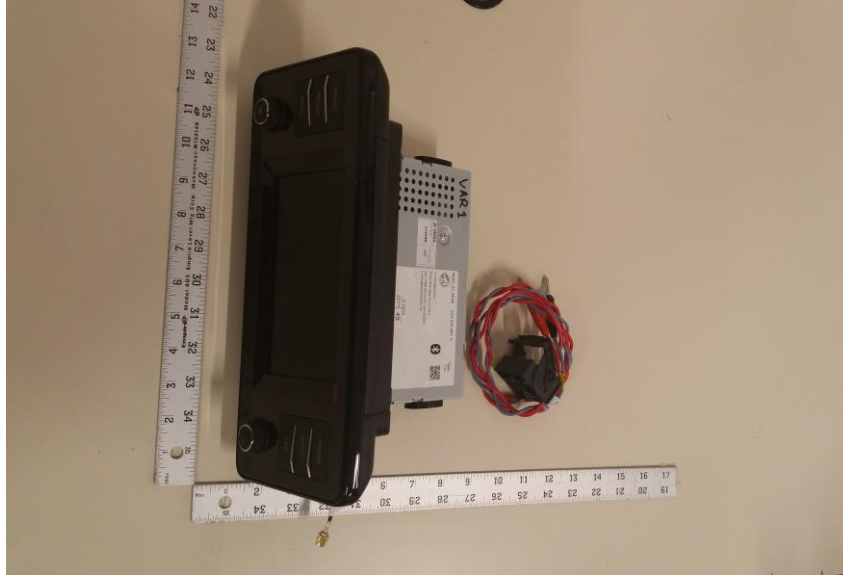
Figure B1: DUT Sample