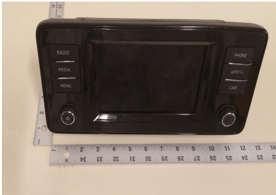
Figure B2: DUT Front view