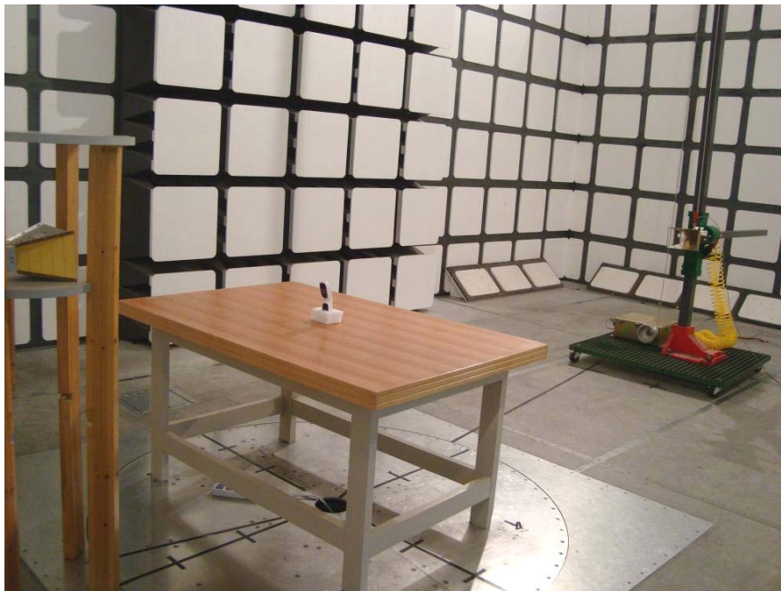
Spurious Emissions - Rear View (Above 1 GHz)