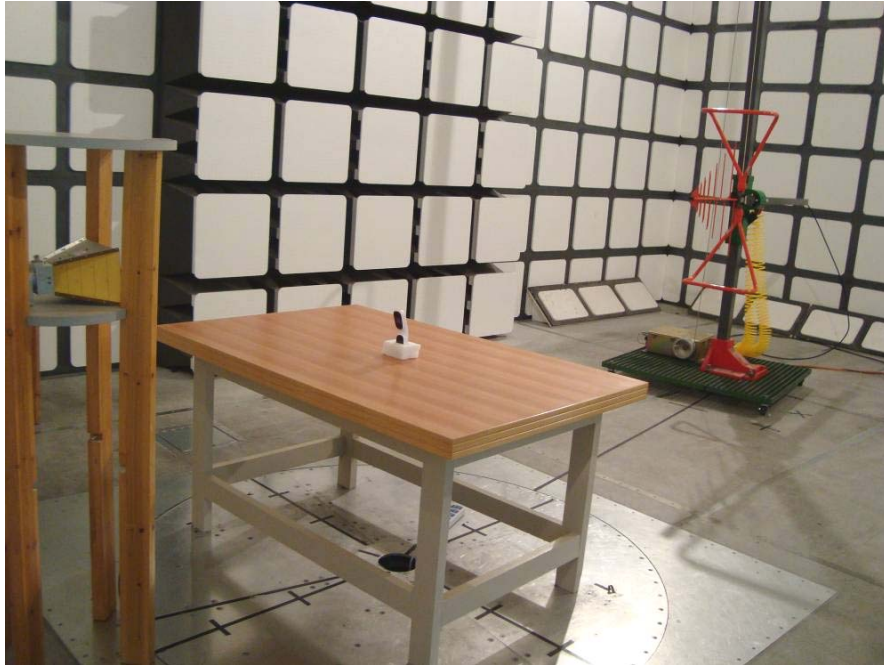
Radiated Emissions - Side View (30 MHz-1000MHz)