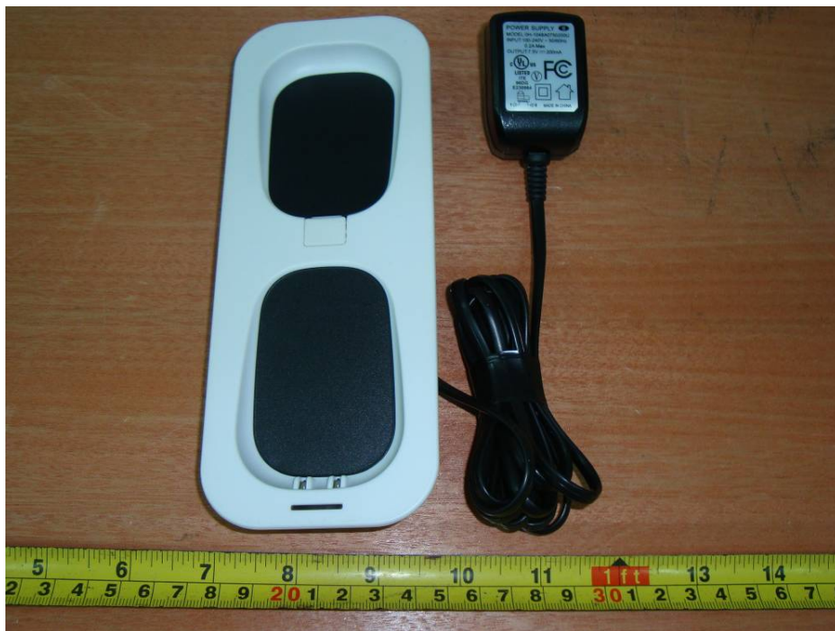
Charger – Top View