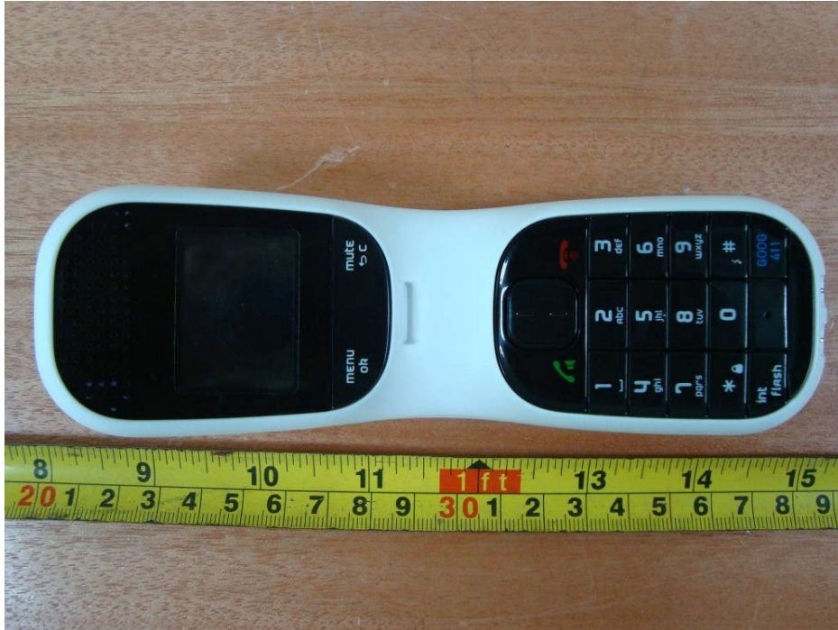
EUT – Bottom View