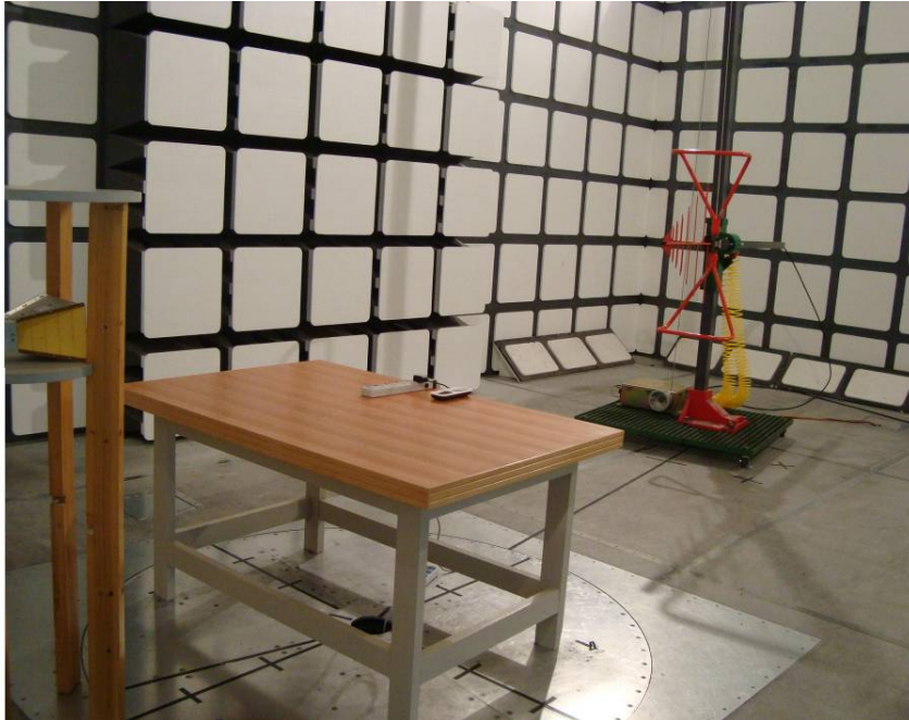
Radiated Emissions - Side View (30 – 1000 MHz)