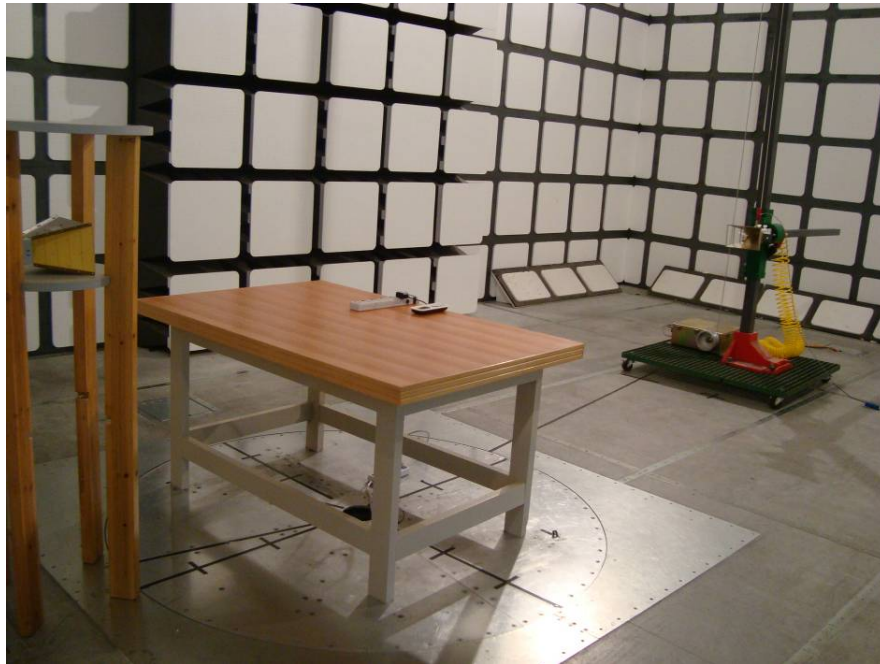
Spurious Emissions - Rear View (Above 1 GHz)