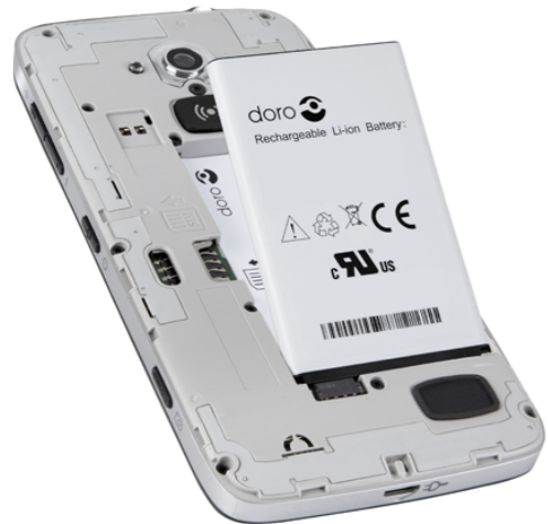
EN: Insert the battery and replace the battery cover