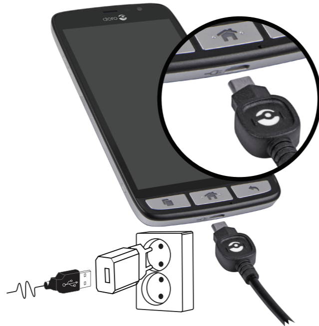
EN: Charge the phone