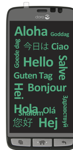
EN: Follow the instructions in the setup assistant to activate your device and set it up.