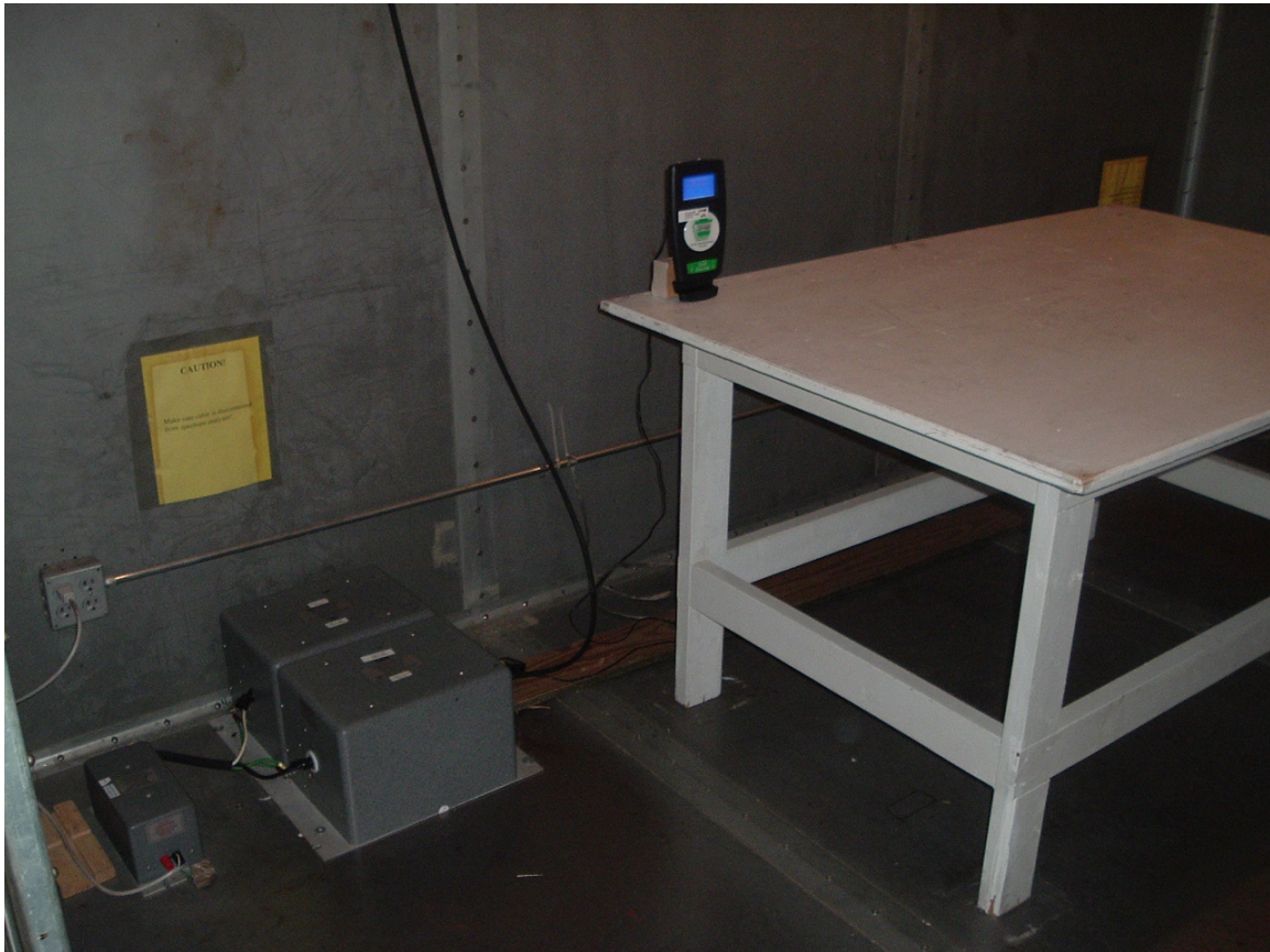
Figure 6 - Test Setup, Power line Conducted Emissions.

FCC ID: WRH – TC01 08-0198 27 July 2009 Ticket Checker FA83-0015 Scientific Games International