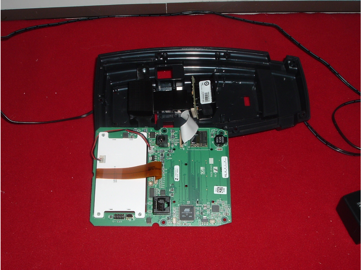
EUT, Cover Off, Component Side of Main PCB

FCC ID: WRH – TC01 08-0198 27 July 2009 Ticket Checker FA83-0015 Scientific Games International