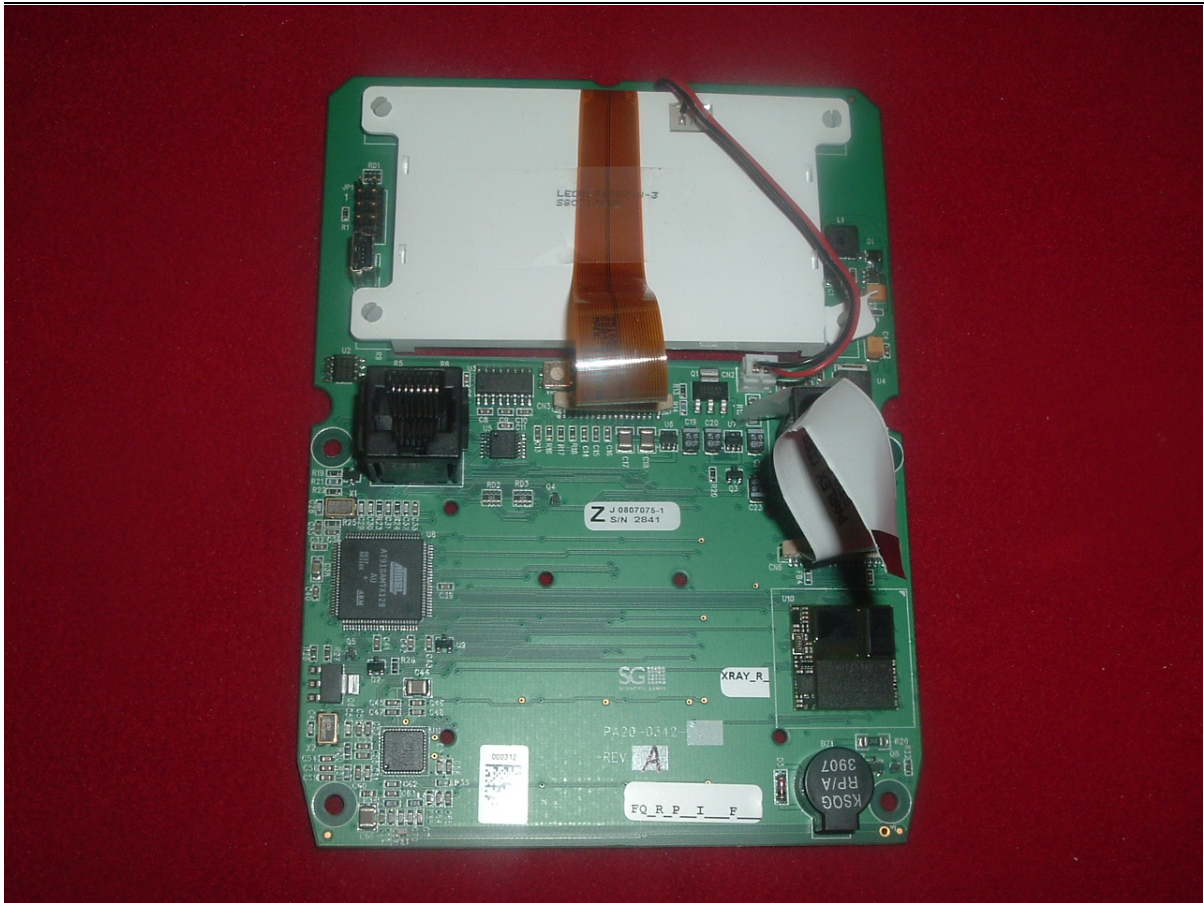
Main PCB, Component Side

FCC ID: WRH – TC01 08-0198 27 July 2009 Ticket Checker FA83-0015 Scientific Games International