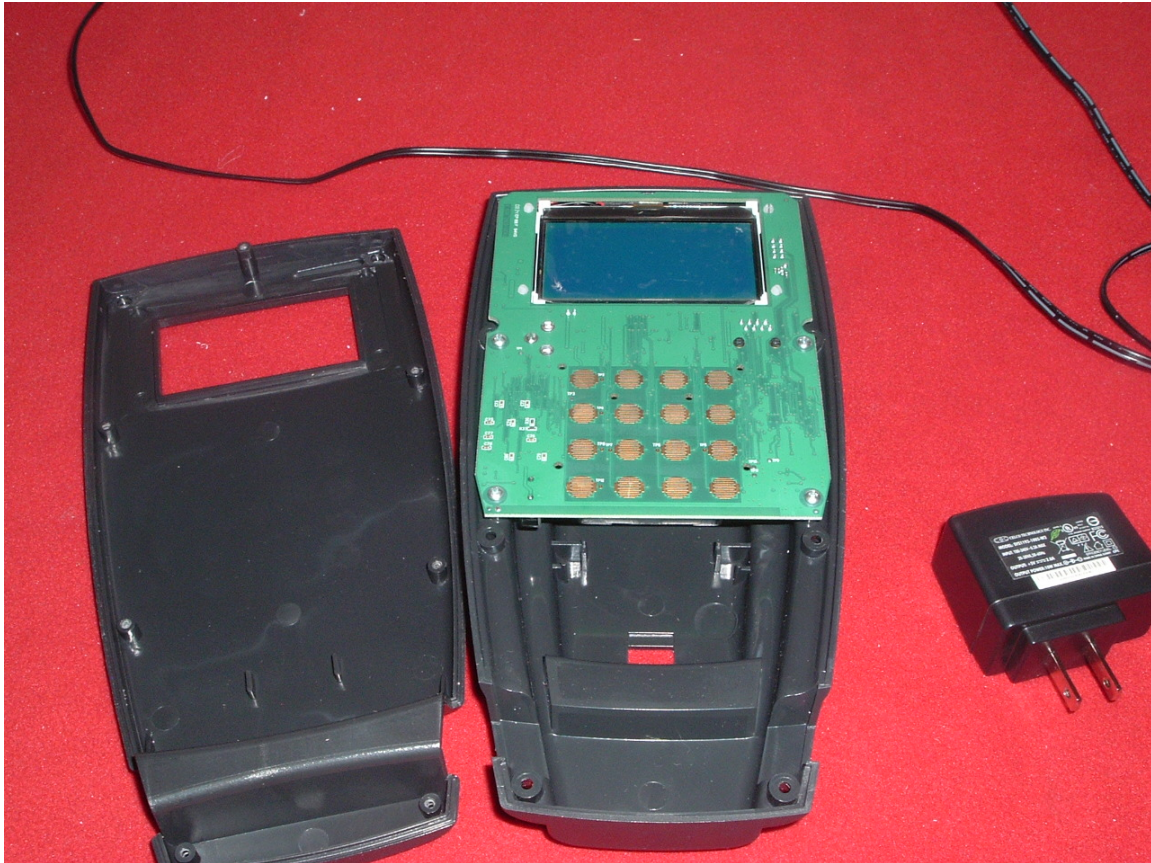
EUT, Cover Off, Solder Side of Main PCB

FCC ID: WRH – TC01 08-0198 27 July 2009 Ticket Checker FA83-0015 Scientific Games International