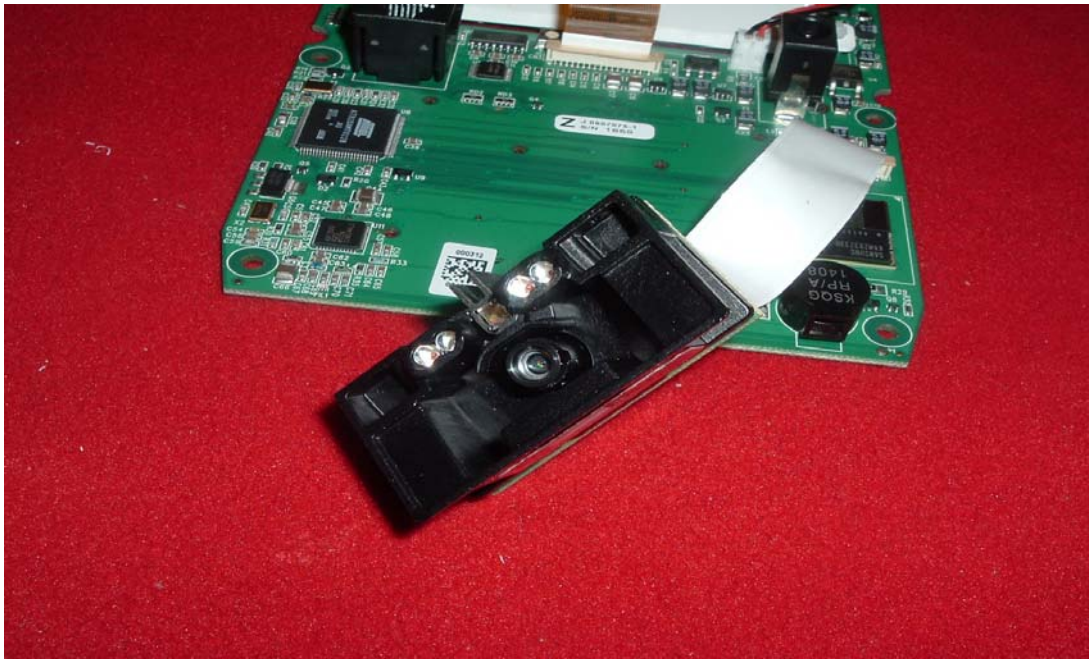
LED Board LED Side