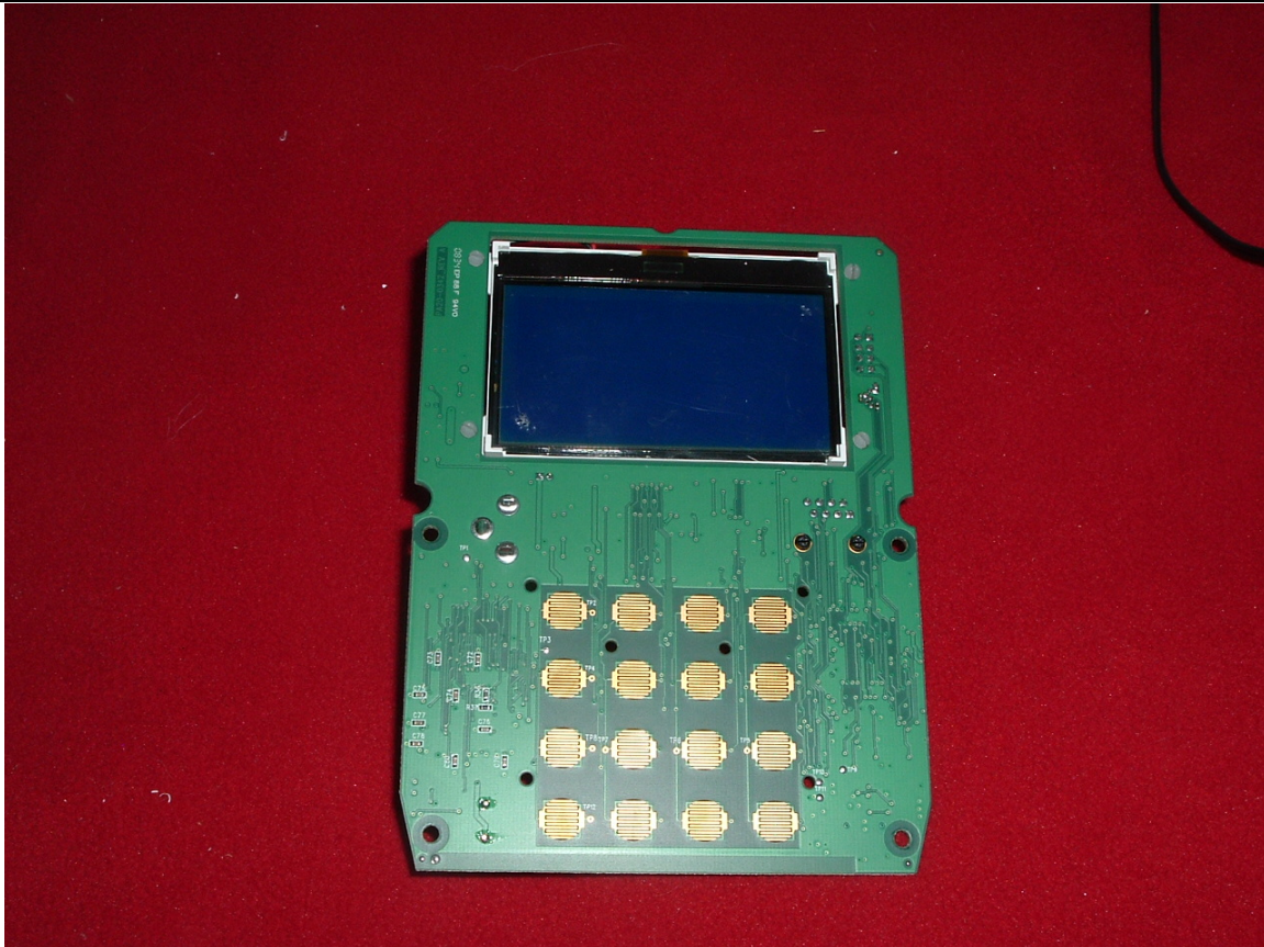
Main PCB, Solder Side.

FCC ID: WRH – TC01 08-0198 27 July 2009 Ticket Checker FA83-0015 Scientific Games International