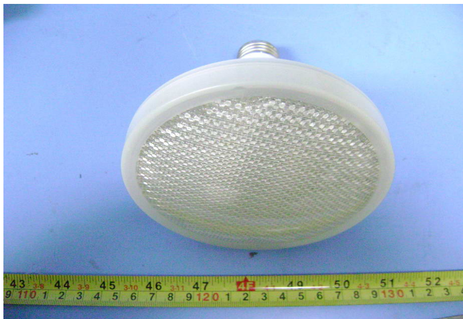
EUT3 - Back View (Model:GP218D)