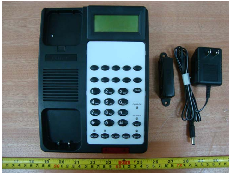
EUT - Top View