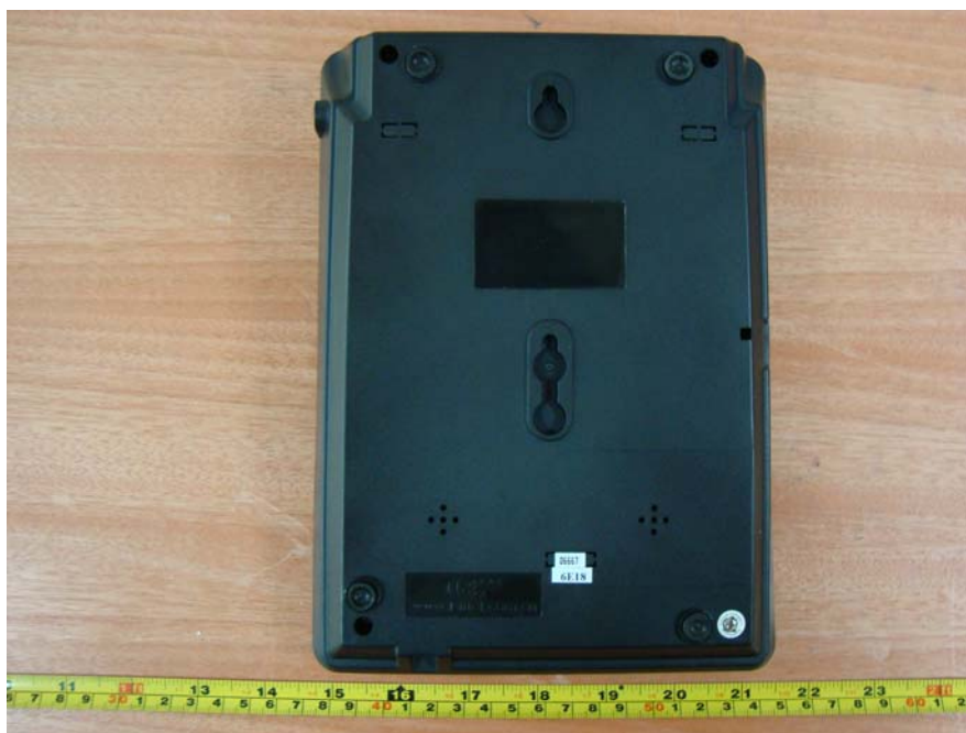
EUT – Rear Side View