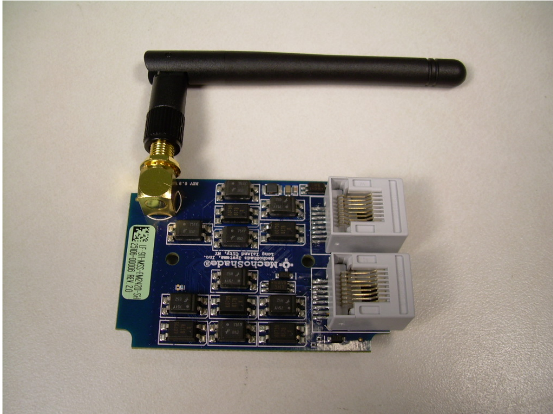
Top Side of the PCB with External Antenna