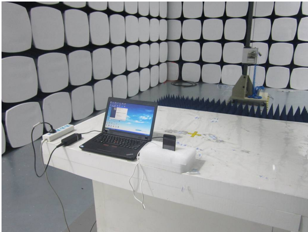
Radiated Spurious Emissions Test Setup Above 1GHz –Front View