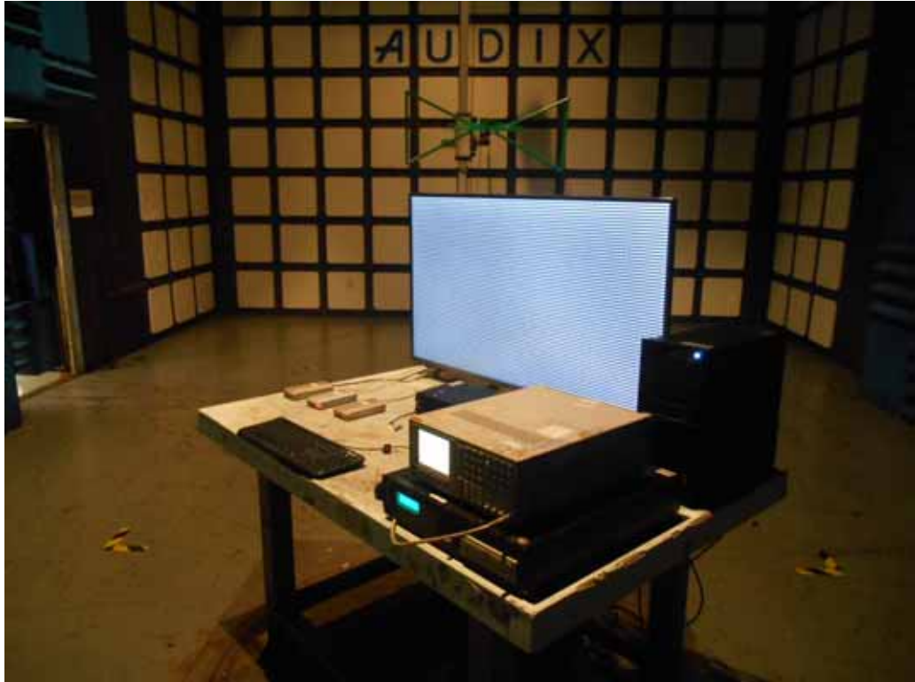
SETUP WITH MAXIMUM DETECTED EMISSION AT HORIZONTAL POLARIZATION (TEST MODE: HDMI 3840*2160@60Hz & 1kHz PLAYING)