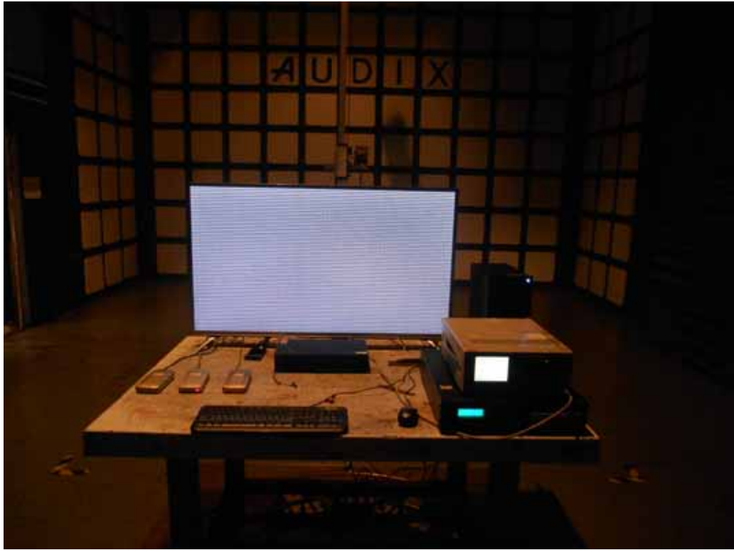
FRONT VIEW OF RADIATED EMISSION TEST (ABOVE 1GHZ)