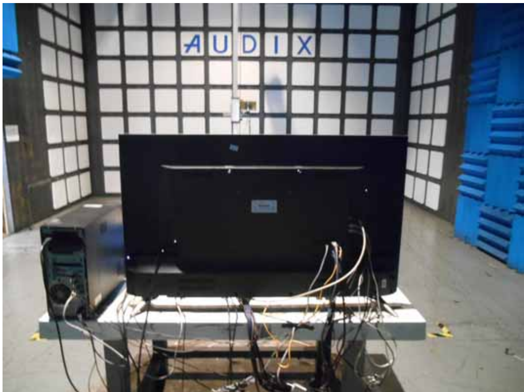
BACK VIEW OF RADIATED EMISSION TEST (ABOVE 1GHZ)