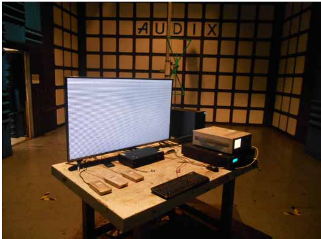
SETUP WITH MAXIMUM DETECTED EMISSION AT VERTICAL POLARIZATION (TEST MODE: HDMI 3840*2160@60Hz & 1kHz PLAYING)