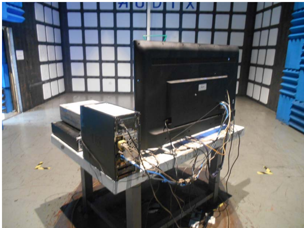
SETUP WITH MAXIMUM DETECTED EMISSION AT VERTICAL POLARIZATION (TEST MODE: HDMI 1920*1080@60Hz & 1kHz PLAYING)