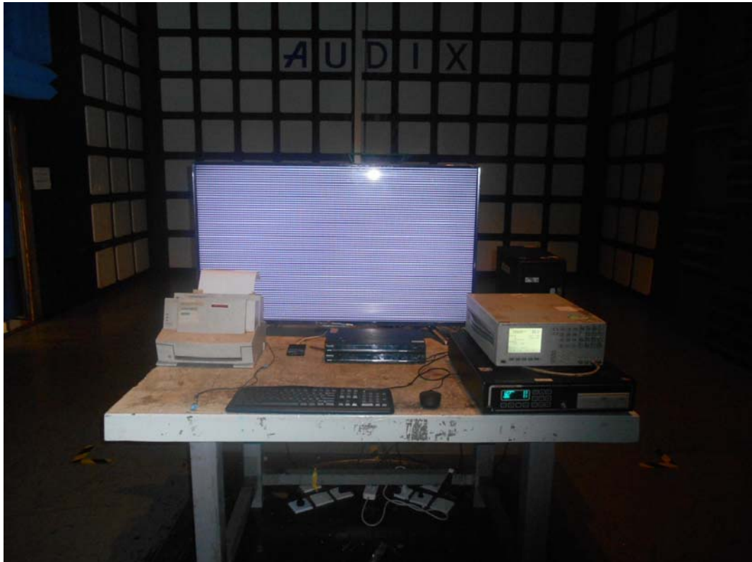
FRONT VIEW OF RADIATED EMISSION TEST