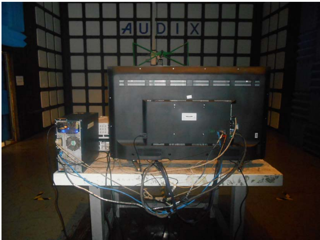
BACK VIEW OF RADIATED EMISSION TEST