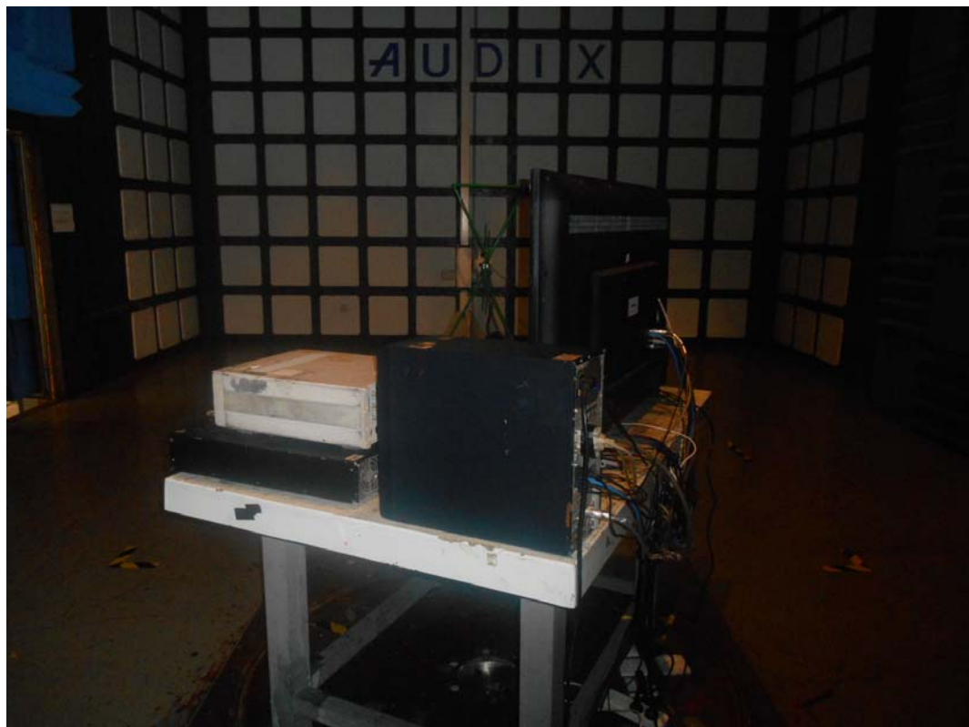
SETUP WITH MAXIMUM DETECTED EMISSION AT VERTICAL POLARIZATION (TEST MODE: HDMI 3840*2160@60Hz & 1kHz PLAYING)