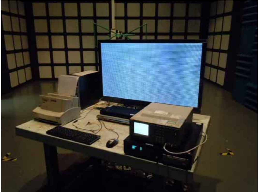
SETUP WITH MAXIMUM DETECTED EMISSION AT HORIZONTAL POLARIZATION (TEST MODE: HDMI 1024*768@60Hz)