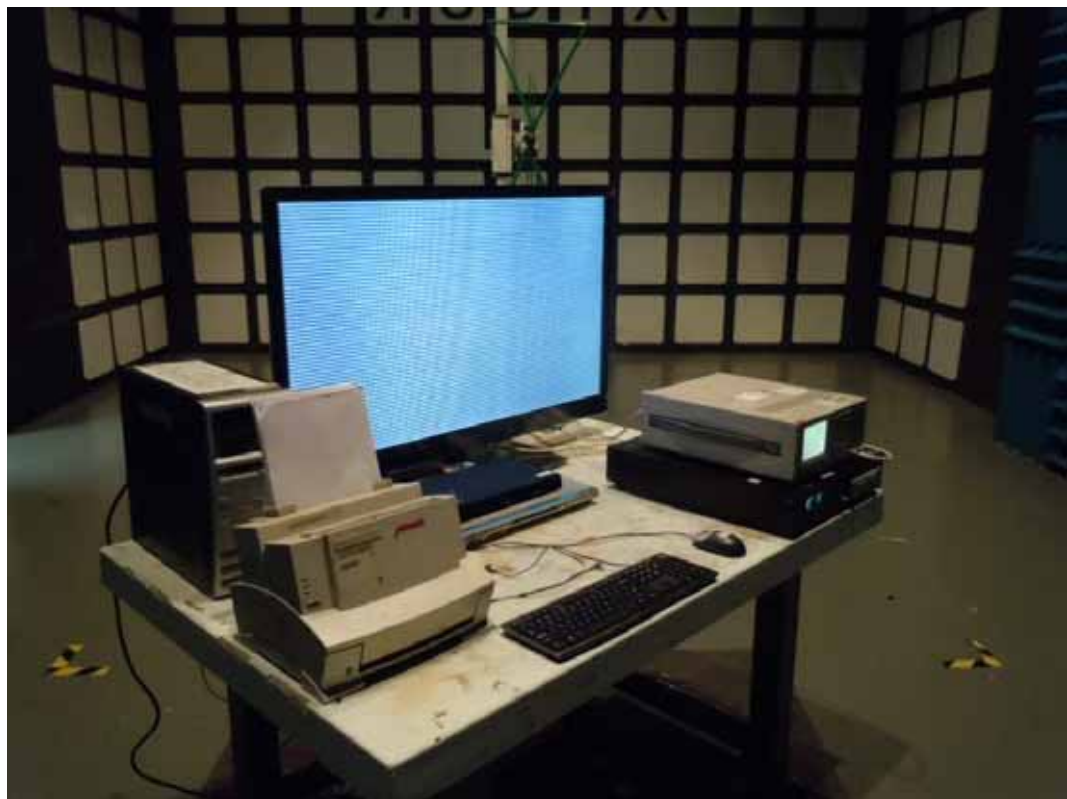
SETUP WITH MAXIMUM DETECTED EMISSION AT VERTICAL POLARIZATION (TEST MODE: HDMI 1024*768@60Hz)