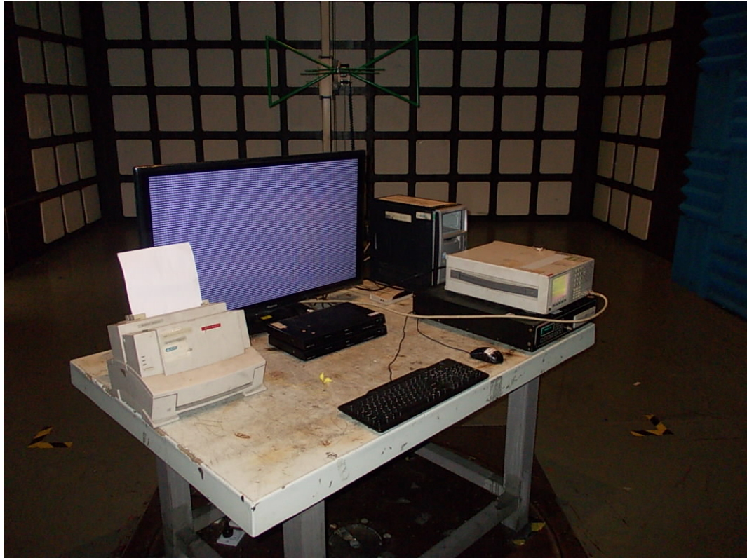
SETUP WITH MAXIMUM DETECTED EMISSION AT HORIZONTAL POLARIZATION (TEST MODE: HDMI 1920*1080@60Hz)