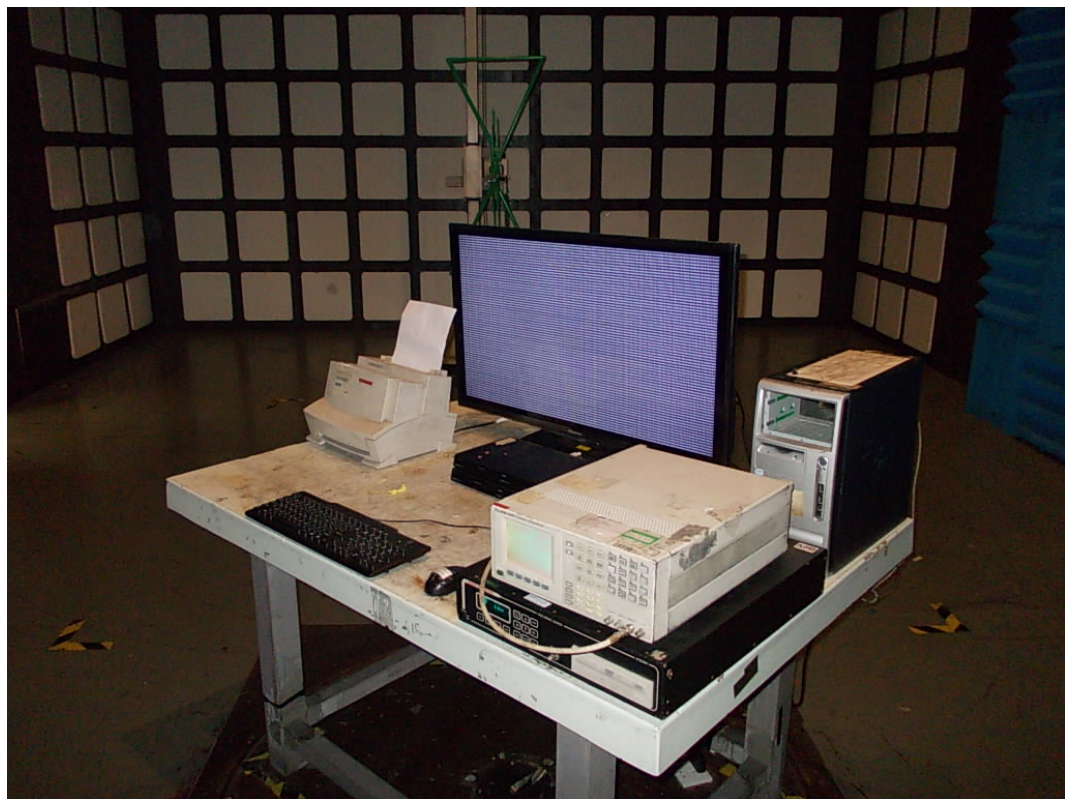
SETUP WITH MAXIMUM DETECTED EMISSION AT VERTICAL POLARIZATION (TEST MODE: HDMI 1920*1080@60Hz)