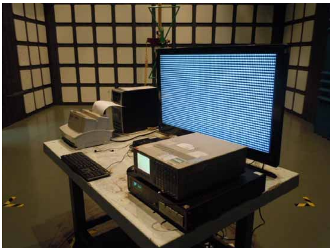
SETUP WITH MAXIMUM DETECTED EMISSION AT VERTICAL POLARIZATION (TEST MODE: D-SUB 640*480@60Hz)