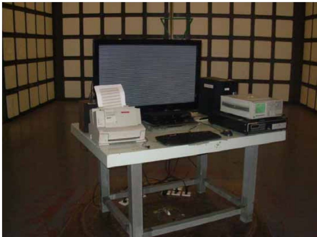
SETUP WITH MAXIMUM DETECTED EMISSION AT VERTICAL POLARIZATION (D-SUB 640*480@60Hz)